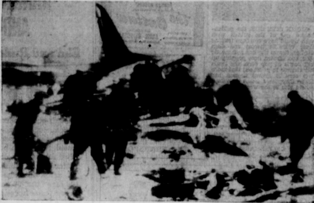
Firemen at Croydon Airdrome, London, England, pour chemicals on a burning transport plane which crashed and burned during takeoff. Eleven of the twenty-three passengers are dead and others seriously injured. The plane was enroute from London to Rome, Italy.