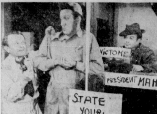
Huntz Hall seems to be in difficulty as his partner, Leo Gorcey, looks on. A scene from "Spook Busters," featuring the Bowery Boys.