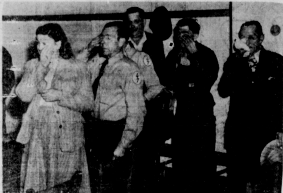
Members of the Columbians, an anti-Negro organization in Atlanta, Georgia, wipe their eyes as they start to leave the meeting room after a tear gas bomb, thrown through a window broke up the meeting. (NEA Telephoto).