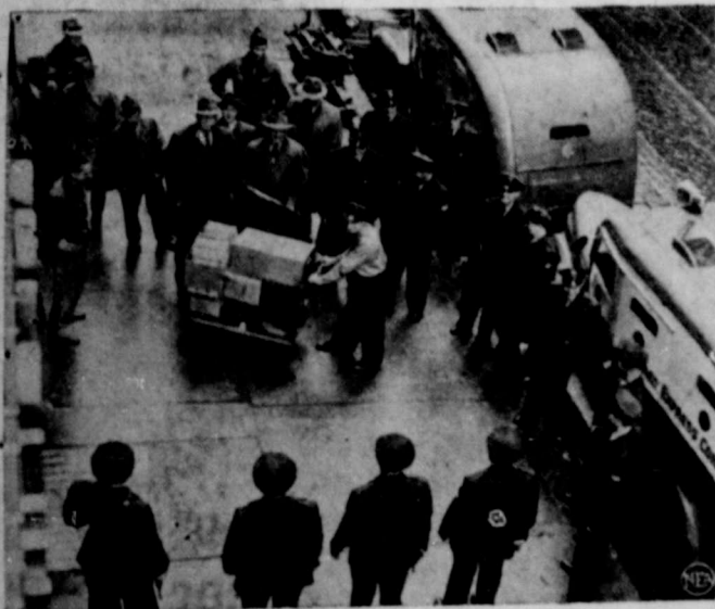
There are almost 10 million dollars on that pushcart seen in center of photo above. Picture shows the fortune as, ringed by police with drawn pistols, it was moved into the new "drive-in" home of the Exchange National Bank of Chicago.