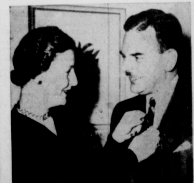
Mrs. Thomas E. Dewey straightens the tie of her husband just after he was informed at the Republican Headquarters in New York City, that he had been re-elected Governor of New York State in a GOP landslide. Dewey defeated Democratic Senator James M. Mead of Buffalo, New York..

Temperature at 1:30 p. m. today. Maximum 68 Minimum 47 Hour's Reading 68 Temperature for the last 24 hours ending at 8:00 a. m. today: Maximum 64 Minimum 59