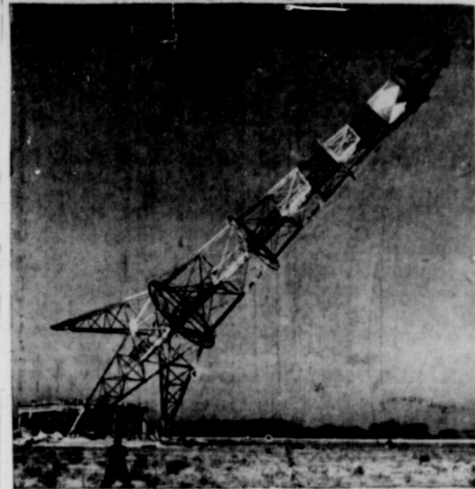
Thousands of spectators at the Ford Airport, Dearborn, Mich., were thrilled recently when they watched the 225-foot dirigible mooring mast crash down, preliminary to dismantlement for scrap. The massive steel tower was severed from its base and pulled over by cables, wound on winches of six 16-wheel tractor-trailer trucks. The mast, built in 1924 at a cost of $250,000, is pictured above, midway in its fall.

Eugene, born the 29th. The mother is the former Alta Mae Wheeler.