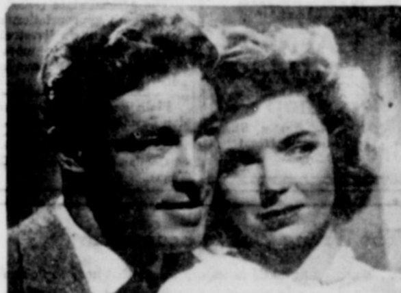
Guy Madison and Dorothy McGuire face the future severely and with confidence in RKO's dramatic story, "Till The End Of Time"

Film Scene taken from the picture showing at Arcadia Sunday and Monday