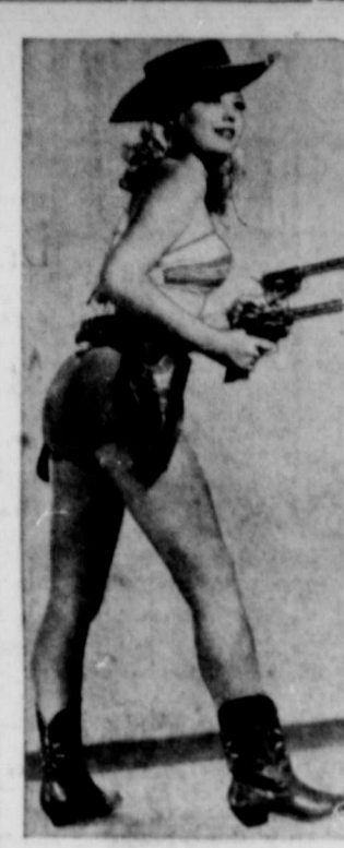
Just to remind you that Hollywood is still part of the wild and woolly West, screen star Adele Mara shows off her new cowboy outfit, but carefully points out that her six-guns are not loaded—just Frontier Day celebration props.