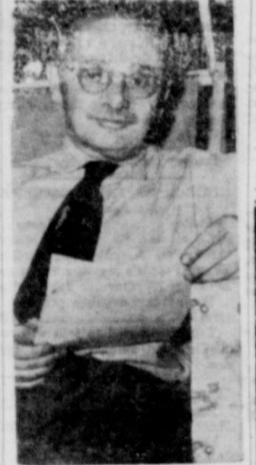
Gerhart Eisler, alias Hans Berger, was named as the secret chief agent of the Communist Party in the U.S. by ex-Communist editor Louis Budenz. This photo of Eisler was made at his residence in New York October 18.

Master Test Overalls, Mens and Boys.—Gordon Dry Goods Co, Gordon, Texas.