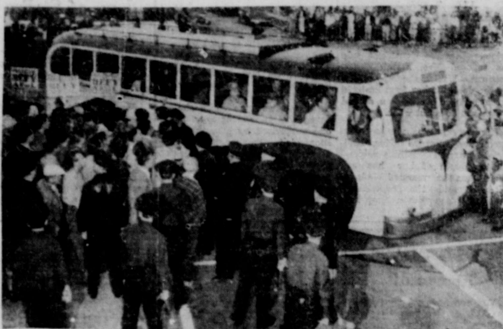
Policemen battle with pickets as they open a hole through a mass picket line at Warner Bros. studio in Burbank, Calif., to enable a bus load of rival unionists to go to work. The strike is an outgrowth of a jurisdictional dispute between the AEL Conference of Studio Unions and the International Alliance of Theatrical Stage Employees. (NEA Telephoto).