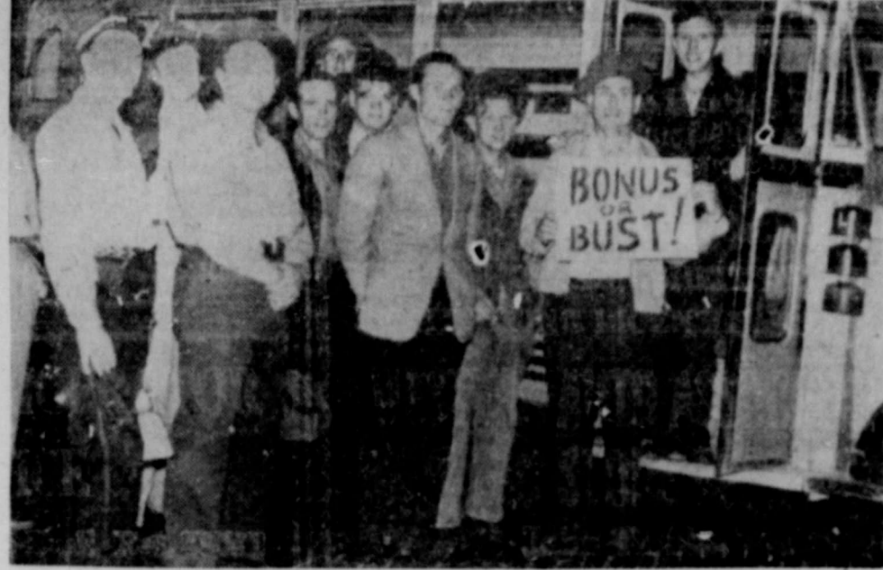
Preparing to leave Springfield, Mo., for the State Capital at Jefferson City, Mo., these veterans load into the only bus in the bonus convoy which included 60 cars, 1 truck and 1 bicycle. Vets have announced they will camp on capitol grounds until a state bonus of $400 for World War II veterans is voted. (NEA Telephoto).