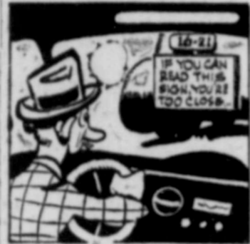
Keep a safe distance from vehicle ahead. When roads are slippery allow three to six car lengths for every 10 mph.

COUNTY SCHOOL SUPERINTENDENT Homer Smith