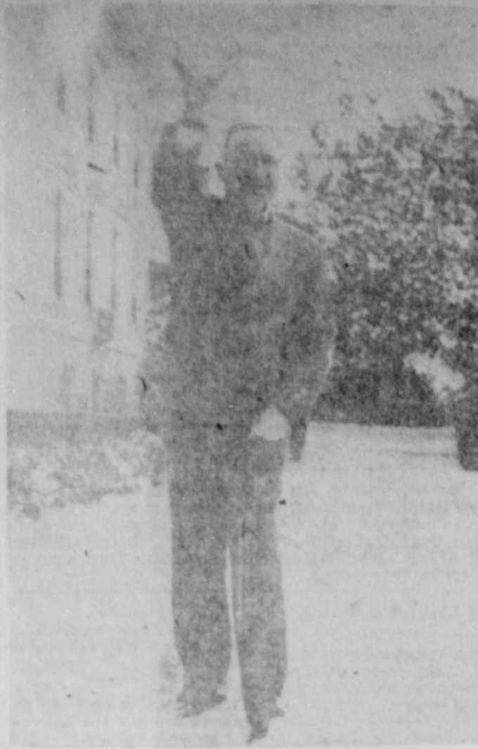
President Harry S. Truman, finding himself without an appointment, stepped out of the White House to view a 7 inch snowfall that blanketed the Nation's Capital. He couldn't resist making a few snowballs, and here, he tosses one at the White House photographers.