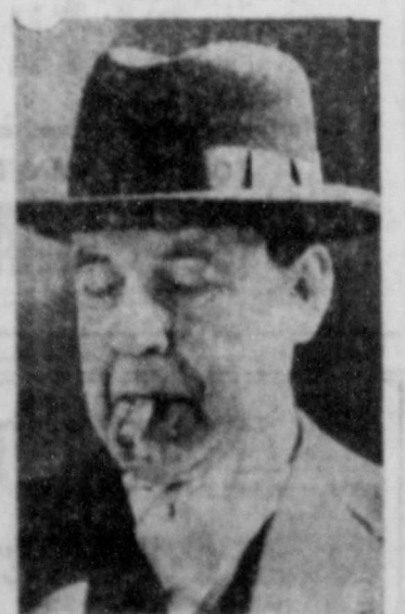
Sir John Anderson, above, chairman of the British Atomic Energy Advisory Committee, will accompany British Prime Minister Attlee to Washington for conferences with President Truman and American experts on what to do with the atom bomb secret.