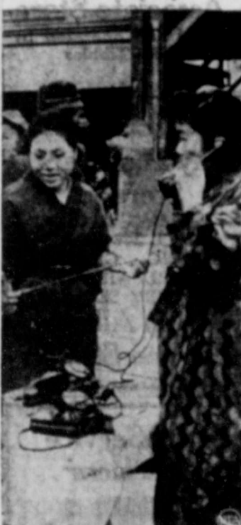
There's little privacy in Japan's telephoning these days as restoration of war-paralyzed services proceeds and phones are set up outdoors. The scene above is at the bombed-out railroad station at Utsunomiya, near Tokyo.