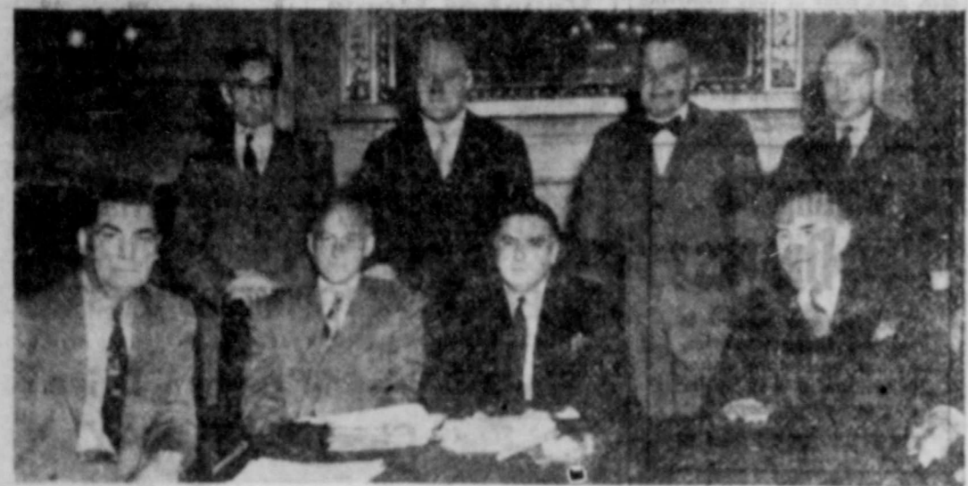
Newly appointed members of the Senate Atomic Committee gather for their first meeting to organize a staff and procedure for one of the most momentous tasks in Congressional history.