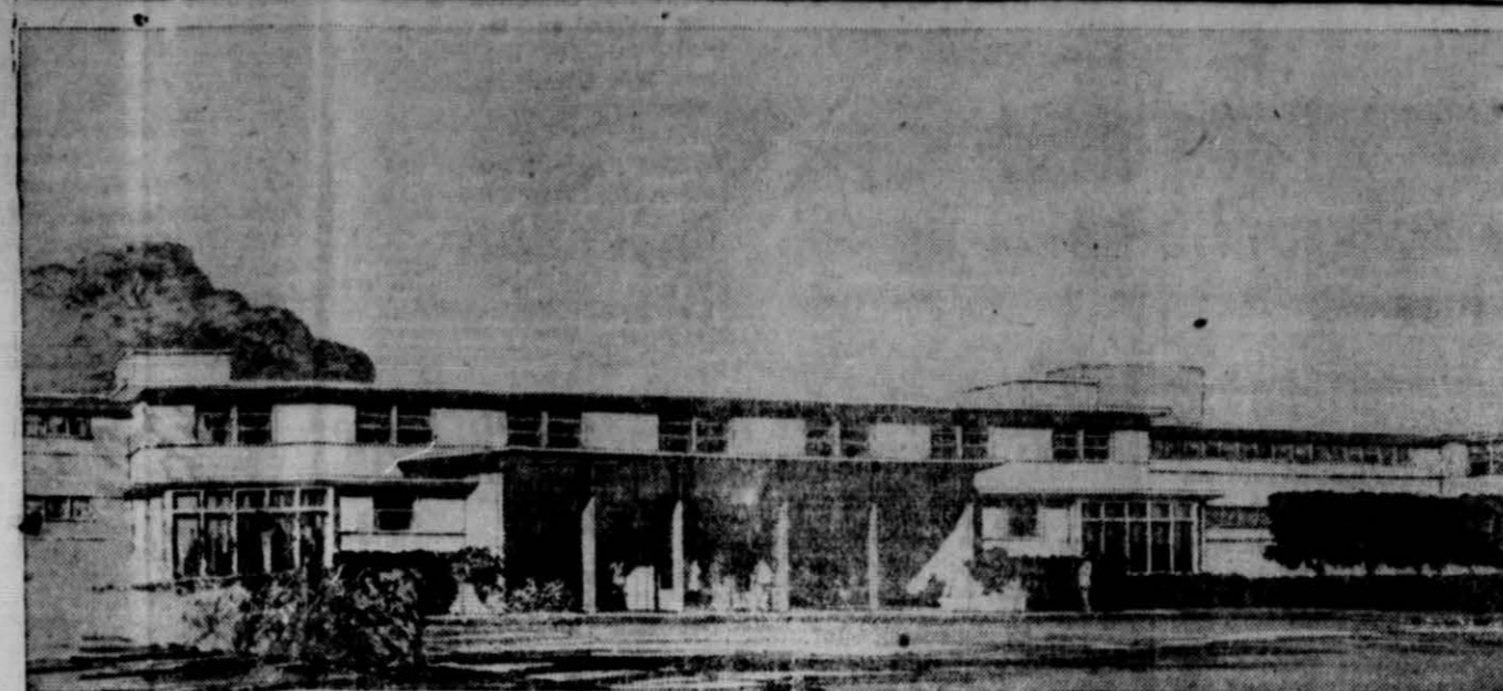
LUXURY DESCRIBES ARLINGTON FARMS - The $7,500,000 residence halls project designed to become home for thousands of Government girls newly-arrived in Washington, D. C., employ every modern discovery of construction, including weather, fire- and wear-resistant