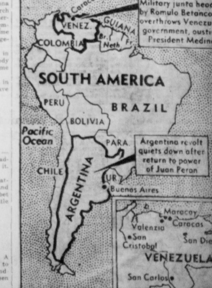
Military junta in Venezuela overthrows President Medina to again throw the South American political situation into turmoil. Map shows Venezuela in relation with South America and Closeup.