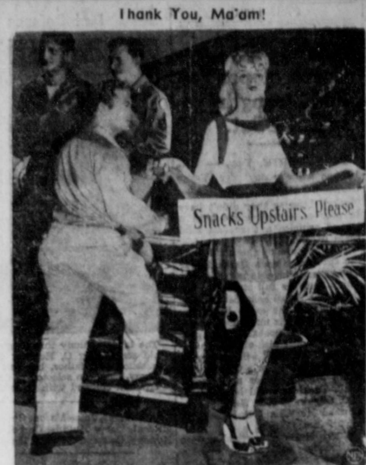
I thank You, Ma'am! Many a serviceman is momentarily fooled into a friendly greeting or a sharp whistle when they see this lovely hostess at the American Red Cross Service Club in Bologna, Italy. If they stop for further pleasantries, however, they soon learn she isn't real, just a mannequin who gave up her job in a department store to go into war work.

University Of Mexico Attracts 140 Texas People