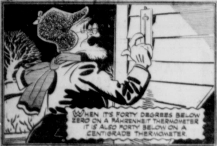
WHEN IT'S FORTY DEGREES BELOW ZERO ON A FAHRENHEIT THERMOMETER IT IS ALSO FORTY BELOW ON A CENTIGRADE THERMOMETER.