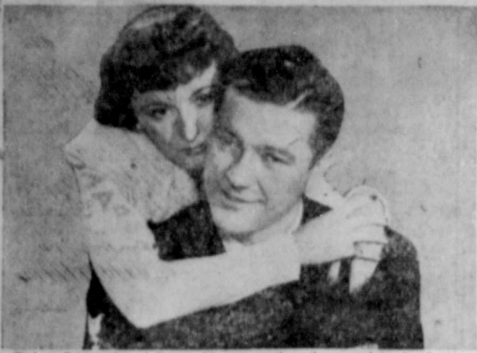
Barbara Stanwyck and Dennis Morgan are happily teamed in the forthcoming Warner Bros. picture of romance, "Christmas In Connecticut"