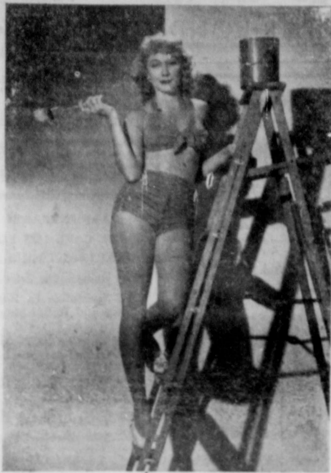
GLORIA GRAHAME is shown in the act of painting herself a bright future. Picked by M-G-M talent scouts for her success as a stage comedienne, Gloria has the rare advantage of playing the lead in her first picture, "Blonde Fever."