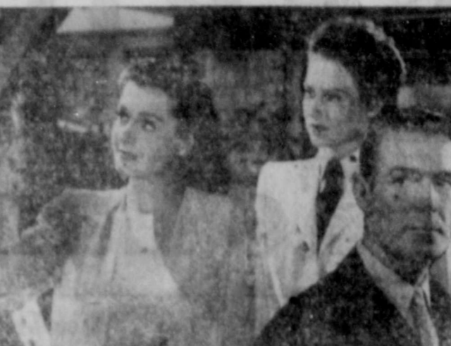
The eternal triangle... "China Sky," a story of love and destiny by Pearl S. Buck, starring Randolph Scott, Ruth Warrick and Ellen Drew