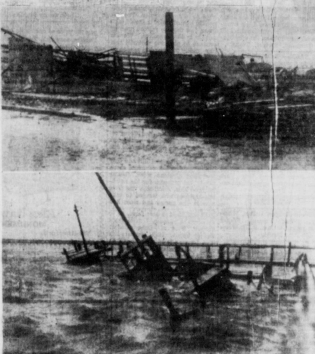
Top photo pictures some of the damage done to Rockport, Tex., by a hurricane which slashed the Gulf Coast. Wind was blowing at 75 miles per hour when this picture was made. Bottom photo shows just one of many fishing boats sunk by the storm. Hourly reports of property damage soared. Thousands of homes and summer cottages were crushed, whole towns were isolated and plunged into darkness. The fishing boats pictured above were docked at Rockport, Texas.