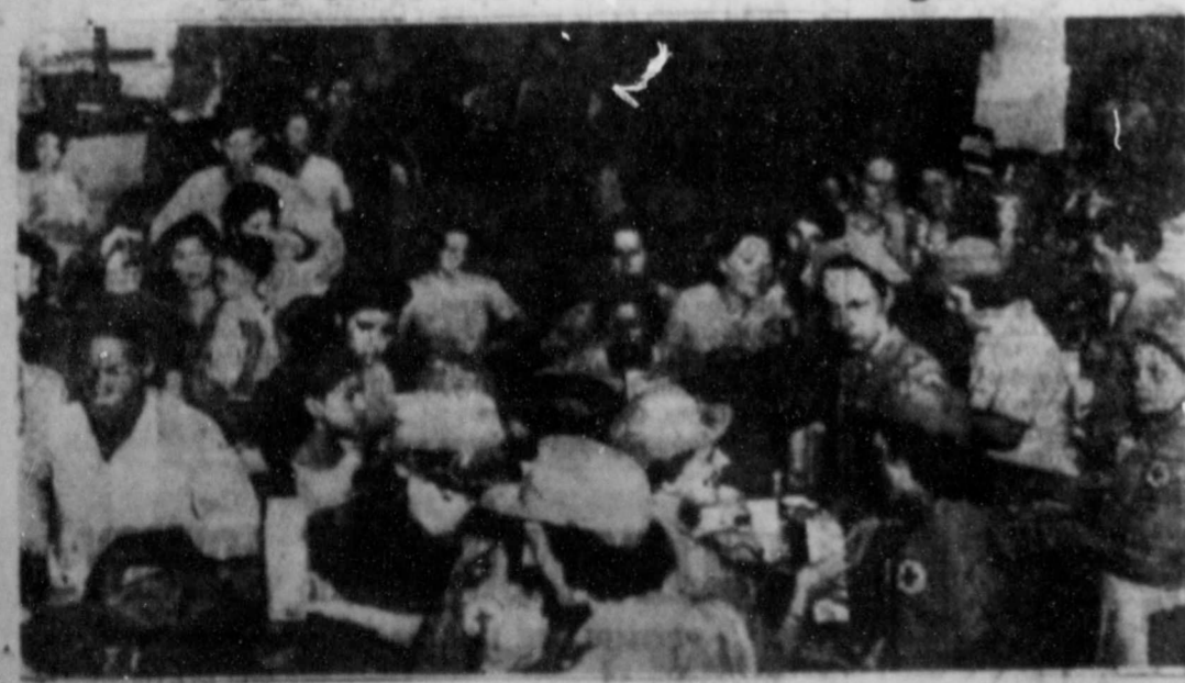
The Texas hurricane refugees are fed by the Red Cross at Houston, Texas. More than six thousand people sought shelter with the Red Cross at the Houston Coliseum.