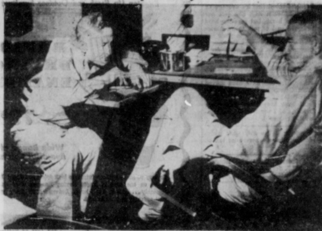
Teamed up again in delivering the devastating 1,000 plane attack on the Tokyo area are Admiral Wm. F. Halsey, right, and Vice-Admiral John S. McCain, left, carrier task-force commander, shown talking over strategy in a stateroom on Halsey's flagship during an early attack. The mightiest naval striking force in history moved to within 200 miles of Tokyo to launch the new attack.