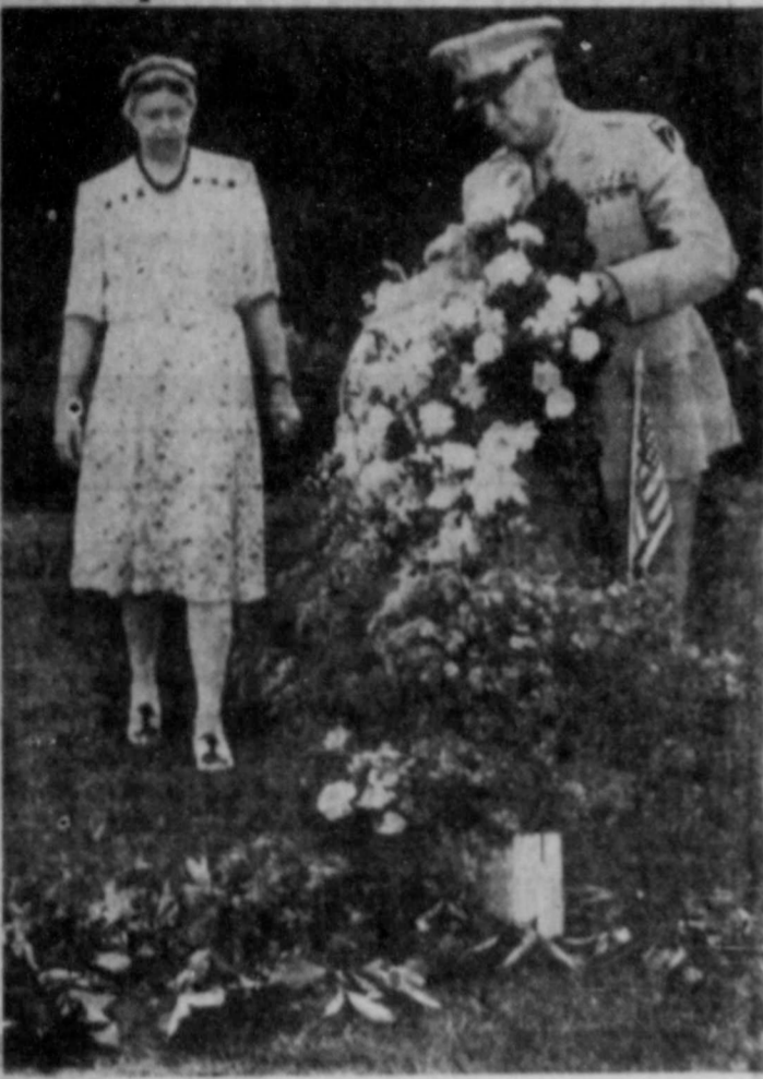
General Dwight D. Eisenhower reports to his fallen Commander-in-Chief. With Mrs. Roosevelt looking on, General Eisenhower places a wreath of flowers at the grave of the late Franklin D. Roosevelt on the Hyde Park estate in lieu of the report he could not make on V-E Day—"Half of the victory is ours.".