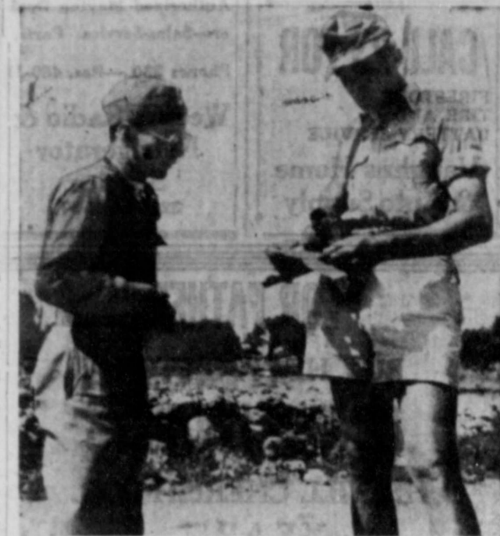
That's a British soldier at left, standing in meek expectancy while an armed German sentry checks his papers before letting him pass. It goes on every day in Crete, where the big German garrison has been allowed to retain its arms, for fear of attack by the vengeful natives. Germans live in Suda Bay area and Allied personnel must have special permits to enter.