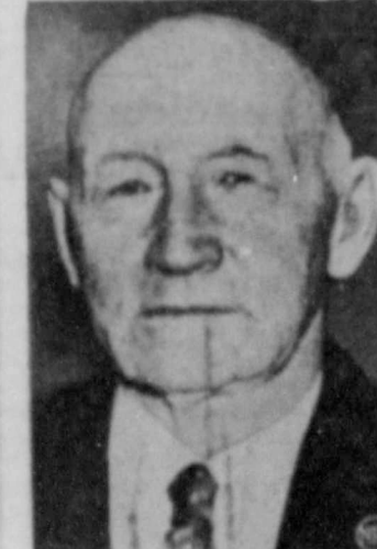
Almost certain to figure most prominently in the drafting of new federal tax laws is Rep. Robert L. Doughton of North Carolina, above, veteran chairman of the powerful House Ways and Means Committee. He already is on record as opposed to tax reductions until after Japan is defeated.