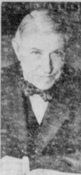
It was "business as usual" on his recent 70th birthday for Associate Justice Owen J. Roberts. Above, he poses for birthday picture in his Supreme Court chambers.