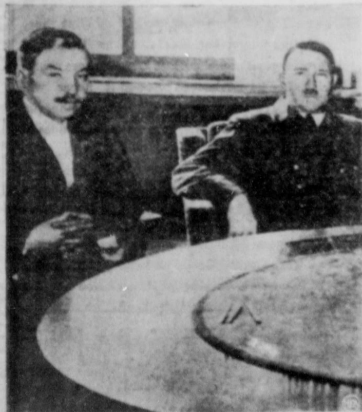
COLLABORATOR—Opportunist Laval guessed wrong for once—and hitched his wagon to a doomed star.