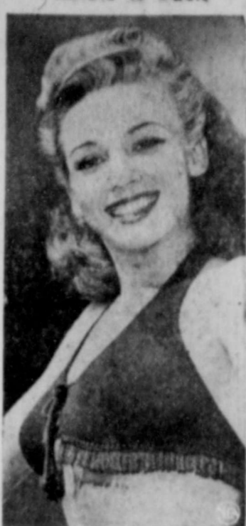
Screen star Carole Landis, above, is back, boys! She'll soon be seen in "Doll Face," her first picture after two years' absence from the screen.