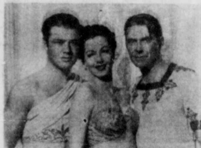
Turhan Bey, Maria Montez and Jon Hall are starred in "Sudan," photographed in Technicolor, with Andy Devine and George Zucco.