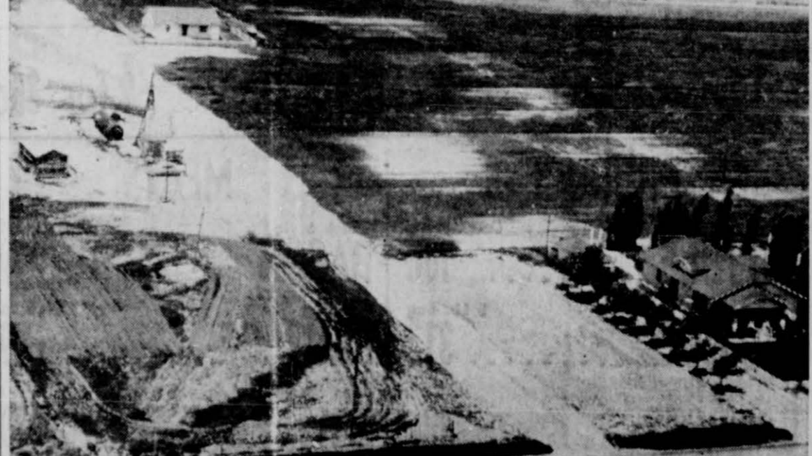
THE NEWS REACHED into its files this week and came up with mystery farm number 40, which is pictured above. This means that the mystery farm series has now been a feature in your county weekly for 40 weeks. Can you identify the above aerial photo of a county farm? Remember, the deadline is Monday noon of each week. The owner is invited to come in and verify identification on the above farm. He will receive a mounted enlargement of the original. This weekly feature is sponsored by Blanton Butane, Inc.