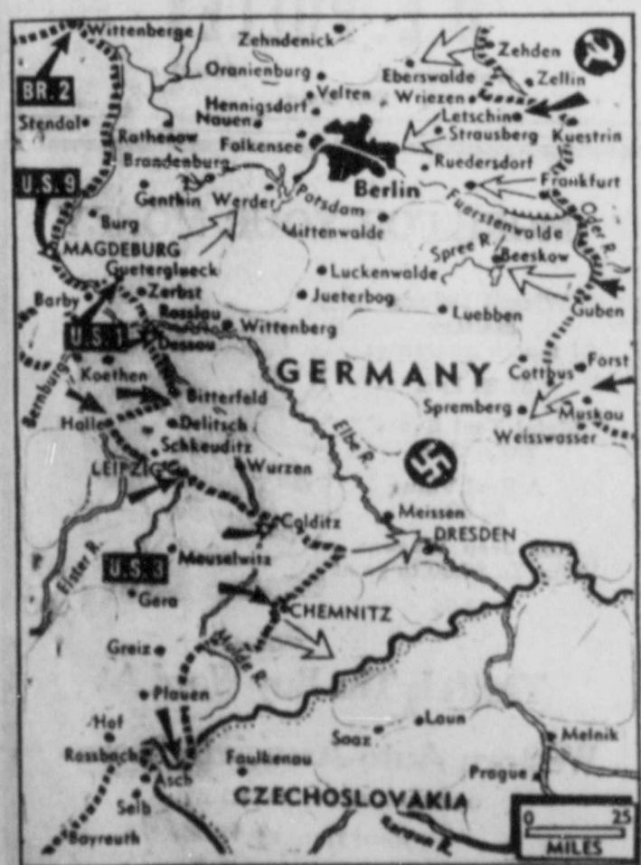
The U. S. 3rd Army plunges across the border of Czechoslovakia at Roszbach to cut off Germany. This Telemap shows the rest of the bi-fronted war area. (NEA Telemap.)