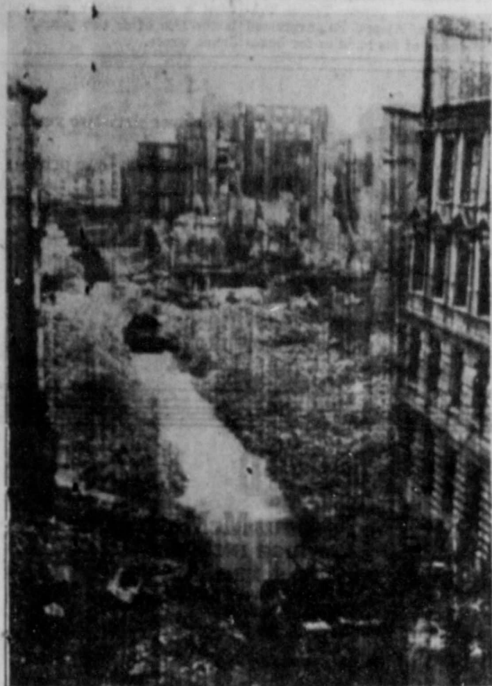
Tank destroyers and men of the 30th Infantry Division, U. S. 9th Army, move past shattered buildings in the rubble filled street of Magdeburg following the captured city in bitter fighting.