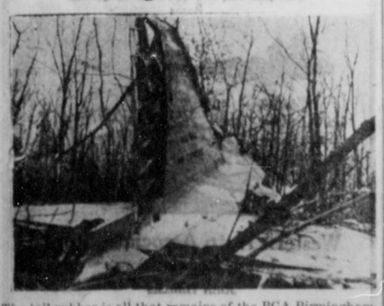
The tail rubber is all that remains of the PCA Birmingham bound passenger airliner that crashed into the side of the Cheat Mt. range at Coopers Rock State Forest, West Va., killing all 20 passengers and a crew of three. Five were military personnel.

THE WEATHER West Texas — Fair tonight and Wednesday. Not much change in temperature.