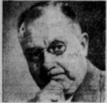
"Guess I've just naturally been counting on a new car as soon as victory rolls around."