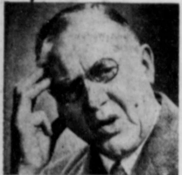
"But they say it may be 2 to 3 years postwar before I can get one! Makes a man stop and think about saving his old car!"