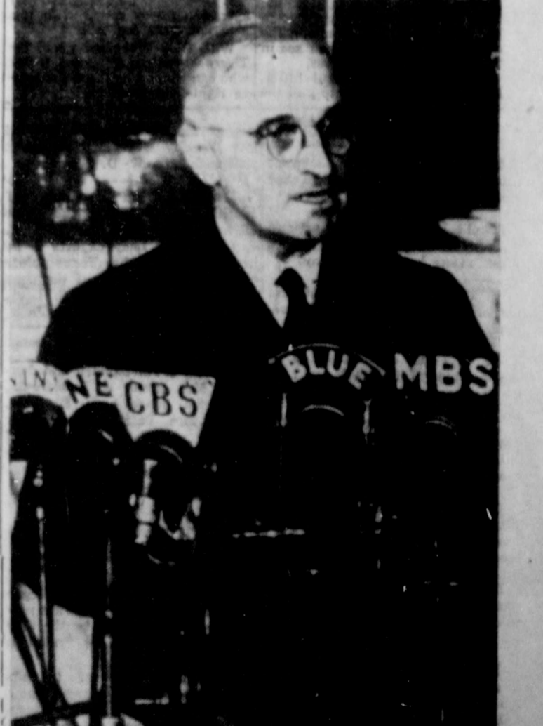
President Harry S. Truman as he addressed Congress and the nation in his first official speech since becoming President of the United States.