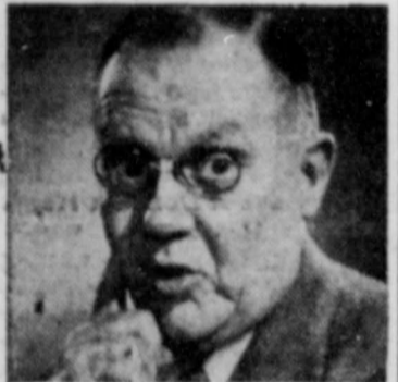
"Luckily, I saw my Gulf man. He said if I let him treat my car regularly with Gulfpride* and Gulflex,** I could be pretty certain that mine will last!"