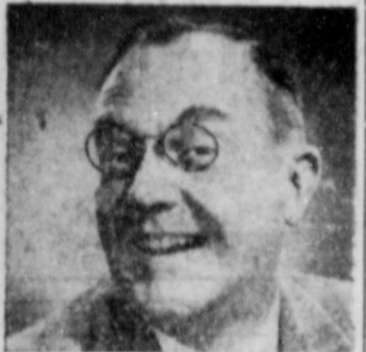
"Well, sir, I'm riding along with the finest lubrication money can buy and I expect to go on riding for a long time yet. So I'm not worrying!"

*GULFPRIDE FOR YOUR MOTOR An oil that's TOUGH in capital letters... protects against carbon and sludge!