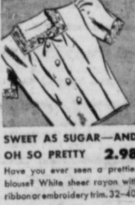
SWEET AS SUGAR—AND OH SO PRETTY 2.98

Firmly woven chambray or cotton covert, cut full for comfortable fit, strongly sewn and SANFORIZED!