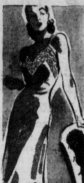
RAYON CREPE SLIPS WITH LUSH LACE TRIMMING 1.69

Size 4 to 6. Save work for yourself! Keep them in overalls. Sturdy cotton denim that can take plenty of hard work.