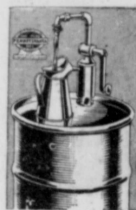
SALE! 100% PURE PENNSYLVANIA OIL 16 1/2

Wards Supreme Quality... no finer oil at ANY price! Long-lasting... free-flowing... triple filtered! Good reasons for buying NOW, at this low sale price. For cars, trucks, tractors.