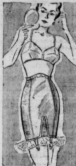
WARDS STURDY SEMI-STEP-IN GIRDLE 3.98

Fine cotton for long wear, lustrous rayon for good looks. Reinforced heels and toes for better service. Elastic tops for excellent fit. 7 to 10 1/2.