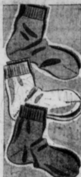
GOOD LOOKING RAYON AND COTTON ANKLETS 20c

The rayon crepe is smooth and soft. The lace trimming, delicate and expensive looking. In a flattering style that fits sleekly, wears well. Size 32 to 44.