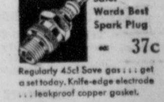
Sale Wards Best Spark Plug 37c

Preserves wood from rot, wire mesh from rusting. One quart paints 12 to 15 average screens!