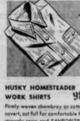
HUSKY HOMESTEADER WORK SHIRTS 98c

Sturdy cotton caps guard your hair against dirt, grease, paint stains. Wide stitched visor shades eyes.