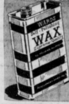
TOP-QUALITY WAX NOW CUT-PRICED! 79c

Practical. It converts easily to stroller as child grows! Comfortable with Duchess type springs for smooth riding! Steel frame... artificial leather body. Folds compactly for storing! See it!