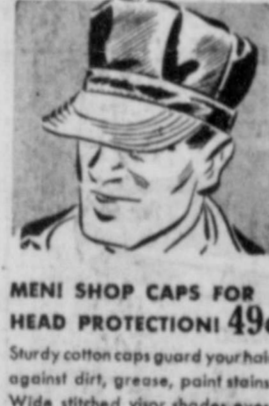
MEN'S SHOP CAPS FOR HEAD PROTECTION 49c

Wide panel back protects baby from drafts... wide spread legs prevent tipping. Sturdy hardwood construction in handsome Maple or Wax Birch finish. Scooped out tray for easy cleaning.