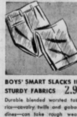
BOYS' SMART SLACKS IN STURDY FABRICS 2.98

Have you ever seen a prettier blouse? White sheer rayon with ribbon embroidery trim. 32-40.