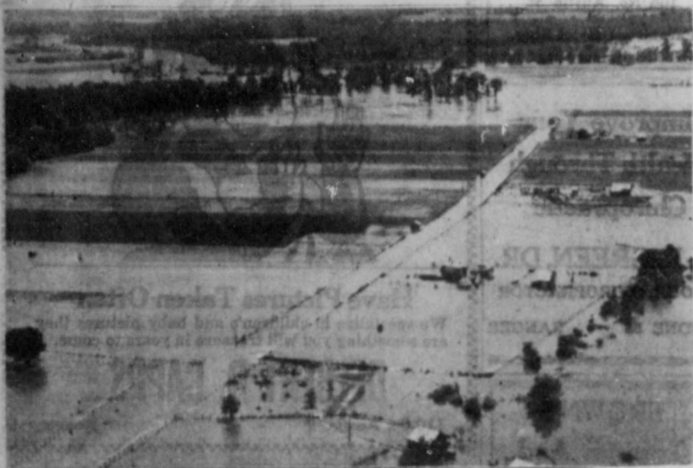
Farms and roads are under water near Monroe, La., where the Ouachita River has swept over its banks. Only the tops of fences protrude to indicate the path of the highway.