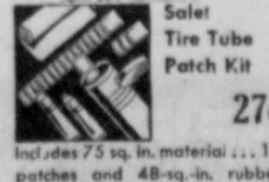
Sale Tire Tube Patch Kit 27c

Mortise tubular lock, with handle on one side, knob on other. For screen or storm door. Zinc finish.