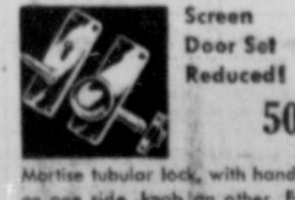
Screen Door Set Reduced! 50c

Regularly 6 for 45c! It's the best buy in town! Packs are so big you'd expect to pay 10c apiece!