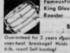
Famous Fire King Glass Roaster $1

A quick beauty treatment for your room! Plain Venetian style of true-reflecting Plate Glass!