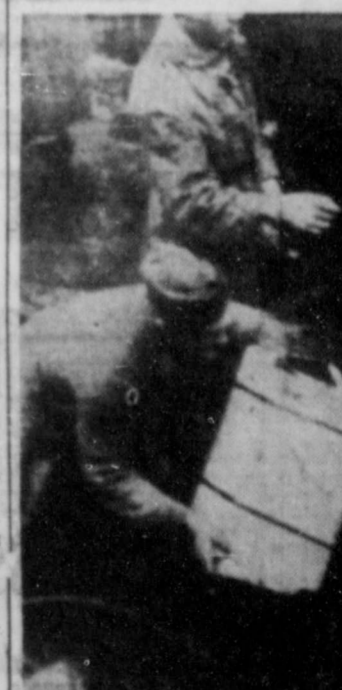
A German flour merchant at Lemgo, Germany, is beaten to the ground by plundering, hungry slave laborers liberated by the 9th Army. Thousands of freed men and women throughout the Reich, are turning on their former captors and pillaging warehouses, trains and QM depots.

Did you know that Abraham Lincoln, when a young man, was challenged to a duel? As the challenged party, he had the right to choose the weapons, which he did. He said, "I choose Irish potatoes at 100 yards." This caused a laugh, and these was no duel.