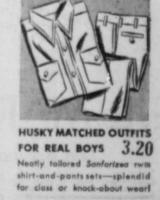
HUSKY MATCHED OUTFITS FOR REAL BOYS 3.20

The most practical item in your youngsters' wardrobe! Finely knit cotton. Needs no ironing.