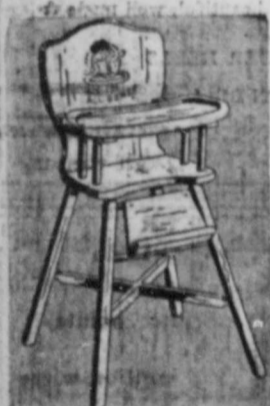
STURDY AND SAFE HIGH CHAIR 7.95

Built to take the toughest weather... and still retain that bright, new appearance! Ceramic Granules form a colorful, fire-resistant surface on a tough, asphalt saturated felt base. Buy now!