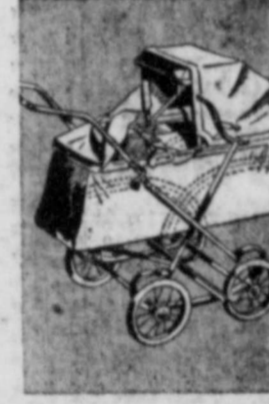
LIGHTWEIGHT CARRIAGE 14.50

Only 20% Down! 49 pounds of slumber comfort in this felted cotton mattress. Durable woven stripe ticking for years and years of service... pre-built border keeps side-walls firm. 4 cloth handles for turning.