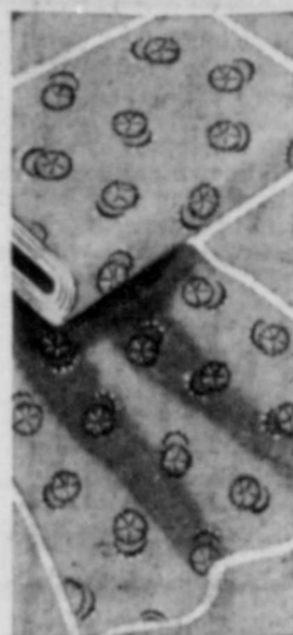
PASTEL RAYON PRINTS—SHEER AND LOVELY! 89c Yd.

Beautifully designed to make your feet look trim and small. Yet so comfortable! They're ebony-black kid oxfords with soft, air cushioned insoles.