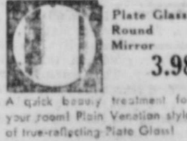
Plate Glass Round Mirror 3.98

Tempered coating for greater resistance and wear! Covers 100 sq. ft. Nails and cement included.