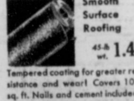
Smooth Surface Roofing 45c sq. ft. 1.45

Sturdy hardwood construction, natural finish. Raised floor protects baby from drafts!