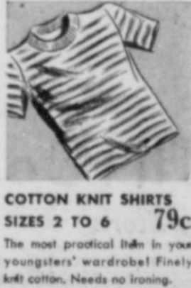
COTTON KNIT SHIRTS SIZES 2 TO 6 79c

Durable blended worsted fabrics—cavalry twills and gabardines—can take rough wear!