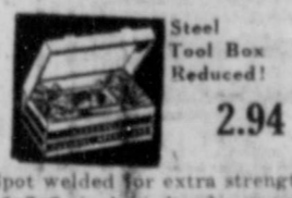
Steel Tool Box Reduced! 2.94

Soft, velvety! Fringe trim! Hand-ome enough to use in any room! Washable! 21"x36" size. See it!