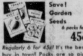
Save! Garden Seeds 45c

Spot welded for extra strength. 16"x7 1/2" inches, handy removable tray. Hump and two catches.