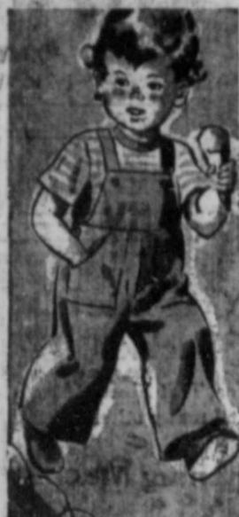
TODDLERS' PRACTICAL OVERALLS 1.19

Size 4 to 6. Save work for yourself! Keep them in overalls. Sturdy cotton denim that can take plenty of hard work.