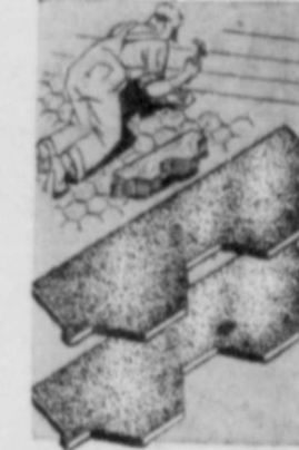
HEXAGON SHINGLE SALE! 4.50

Equals most famous and costliest! Self-polishing wax... shines as it dries! Seals floors with a wear-resisting finish! Contains Carnuba Wax, most durable known! For all surfaces, specially linoleum!