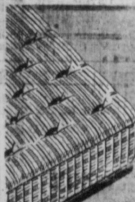
49 Pound Felted COTTON MATTRESS 19.95

Wards Supreme Quality... no finer oil at ANY price! Long-lasting... free-flowing... triple filtered! Good reasons for buying NOW, at this low sale price. For cars, trucks, tractors.