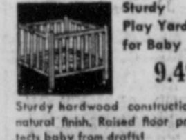
Sturdy Play Yard for Baby 9.49

Colorful cotton rags... won't show soil easily! Well made to stand dozens of washings! Reversible for extra wear! 24"x48" size. Ideal for bedrooms, baths, hallways!