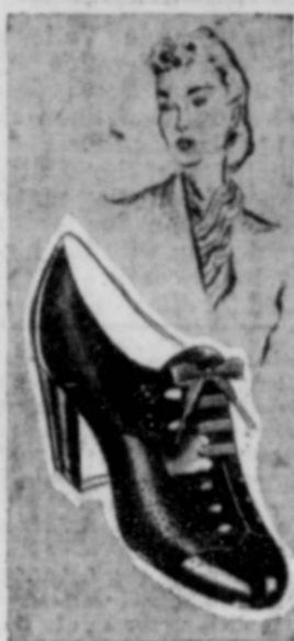
STYLE MEETS COMFORT IN FAMOUS FOOTHEALTHS 4.49

It's firmly boned in front to support and flatten the abdomen. Elastic side panels and back gore make garment flexible and comfortable. 26-34.