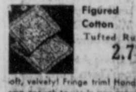
Figured Cotton Tufted Rug 2.77

Regularly 45c! Save gas... get a set today. Knife-edge electrode... leakproof copper gasket.