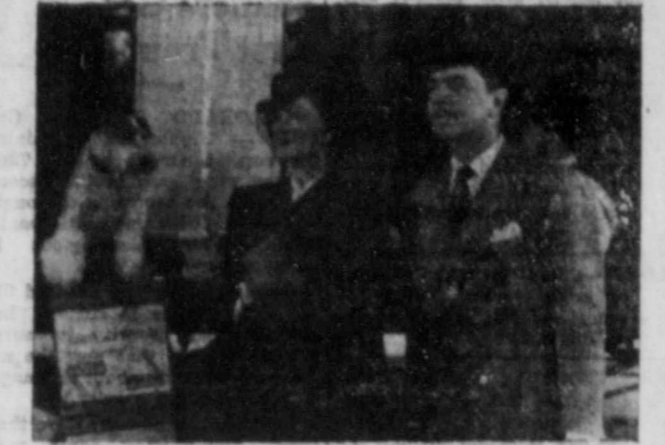
Together again for the first time in two years are William Powell and Myrna Loy in "The Thin Man Goes Home," with Lucile Watson.

More than 100,000 seamen have been graduated from U. S. Maritime Service training stations while an additional 50,000 officers and seamen have been upgraded. While high-speed machines can turn out kitchen matches at the rate of 1,325,000 an hour, a similar match is actually a year in the making due to the time necessary to "season" the wood.