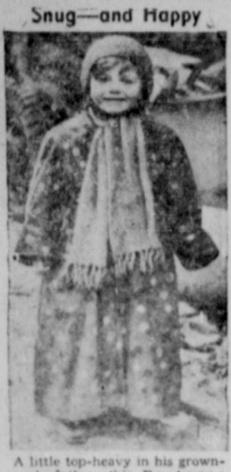
Snug—and Happy A little top-heavy in his grown-up clothes, this Bastogne youngster is warm enough to grin happily at the cameraman. Bastogne, recently relieved of Nazi siege by Gen. Patton's men, are up against it for warm winter clothes.