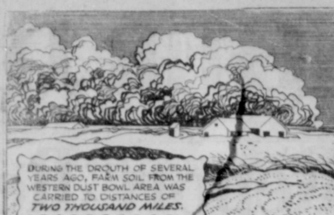
DURING THE DROUGHT OF SEVERAL YEARS AGO, FARM SOIL FROM THE WESTERN DUST BOWL AREA WAS CARRIED TO DISTANCES OF TWO THOUSAND MILES.

Queen Bumblebees Hibernates in Autumn, and They Alone of the Colony Survive the Winter.