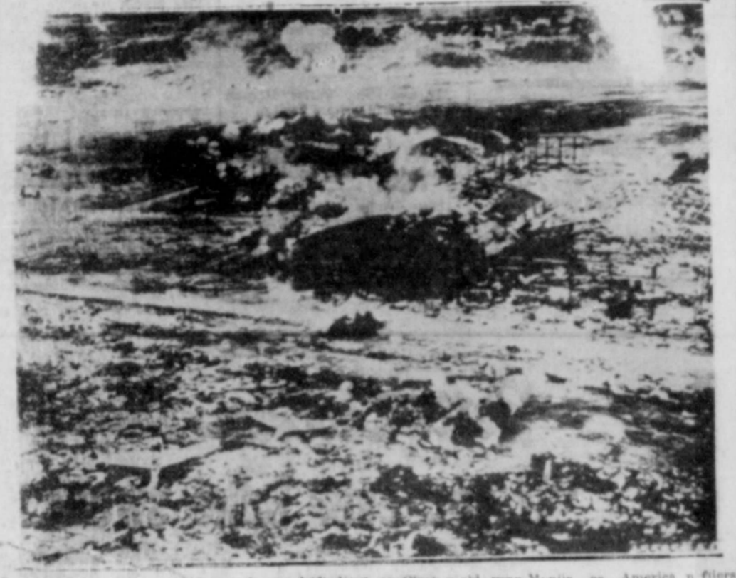
Incendiary bombs, stratched to parachutes, drift down on Clark field, near Manila as American airmen give the field another padding. Allied troops, pushing steadily ahead, were nearing the boundaries of the field, and were apparently about to take it.