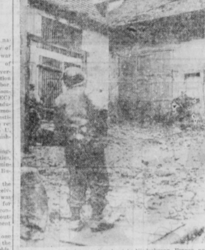
A tense moment during a sniper hunt in Niederbronn, France, newly taken in the 7th Army drive. One infantryman is about to swing open a door while two others cover him.