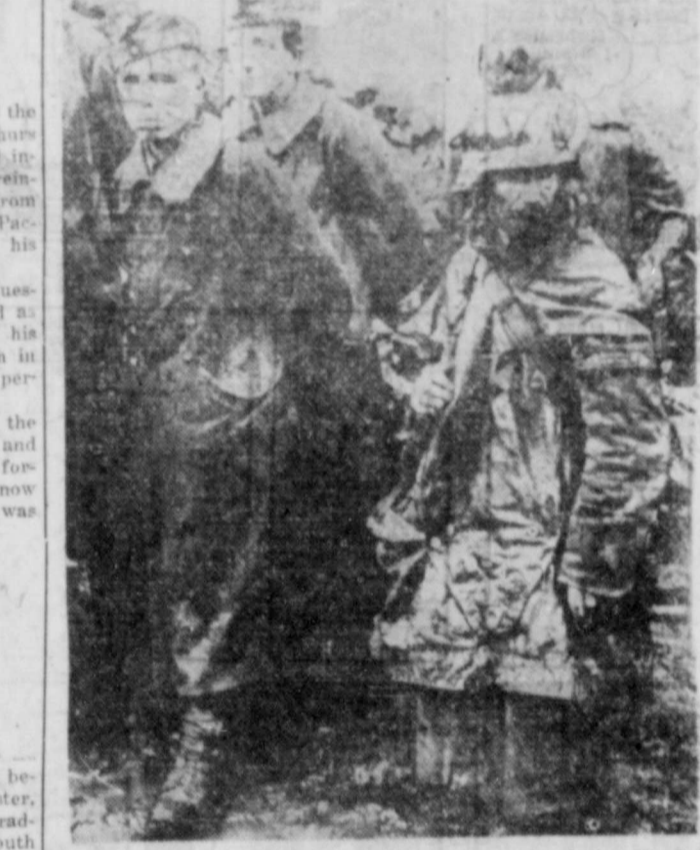
Battle weary Nazis who were the last to surrender during the battle of Hurtgen Forest which ended after several weeks of heavy fighting. The 9th Division captured these prisoners near Jungersdorf, Germany.