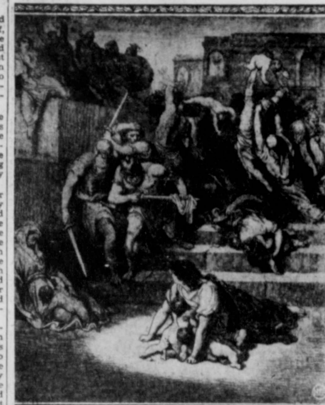
"The Massacre of the Innocents" by Gustave Dore. "It is Herod's command that all male children of two years and under, shall be slain by the sword."