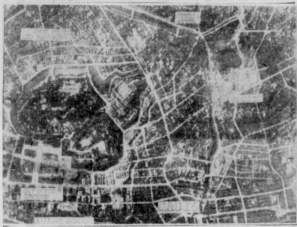
Moated Palace grounds in the heart of Tokyo as photographed for the first time by Saipan-based Superforts. Just below palace, left center, is a large railroad station. The Sumida River runs past a large stadium. At upper right can be seen wartime firebreaks cleared through congested areas, Tokyo's hope against a city sweeping conflagration.