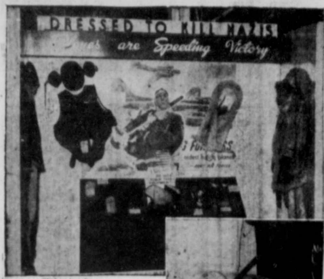
Above is shown the equipment worn by U. S. airmen. At the right is an operating model of a gun turret used on the B-25 bomber. Both of these items, along with other U. S. fighting equipment and captured enemy war materials, will be shown in the giant Aircraft exhibit at Baytown, in connection with Humble Oil & Refining Company's celebration commemorating the production of one billion gallons of 100-octane aviation gasoline on December 14.

FORT WORTH, Tex. (UP)—There's a 60 year old man in Ft. Worth who claims he's an "old