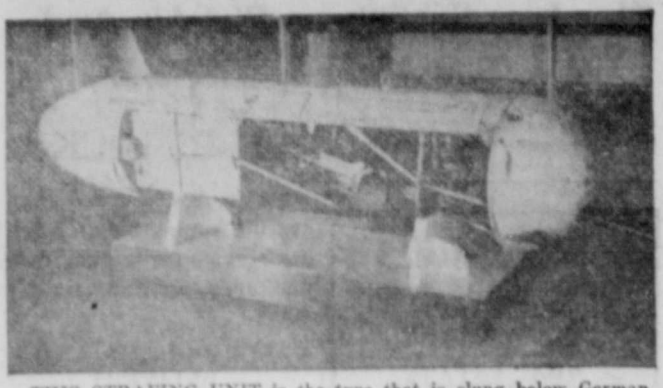
THIS STRAFING UNIT is the type that is slung below German pursuit planes and can fire six guns at various angles. The pilot operates it by remote control. This unit, along with much other captured material, will be displayed at the Aircraft exhibit at Baytown in connection with Humble Oil & Refining Company's ceremony commemorating the production of one billion gallons of 100-octane aviation gasoline on December 14.