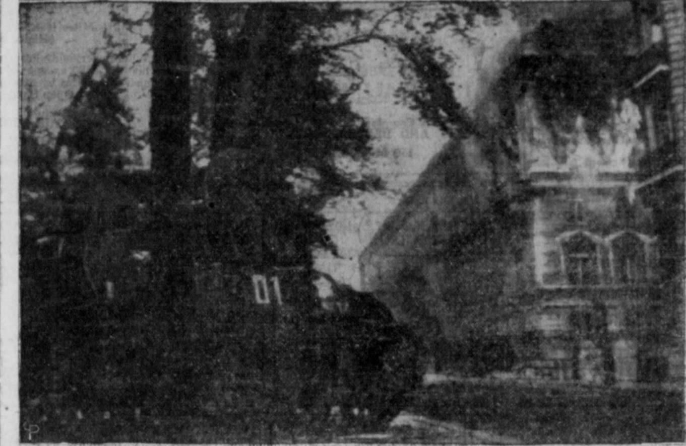
It was in the chamber of deputies, above, that 400 German troops barricaded themselves in putting up the Nazis' last fight in Paris. Troops of the French Second Armored division finally cleaned out the Chamber after an hour battle in which one wing of the building was set afire, as shown above. A French tank is shown at left.