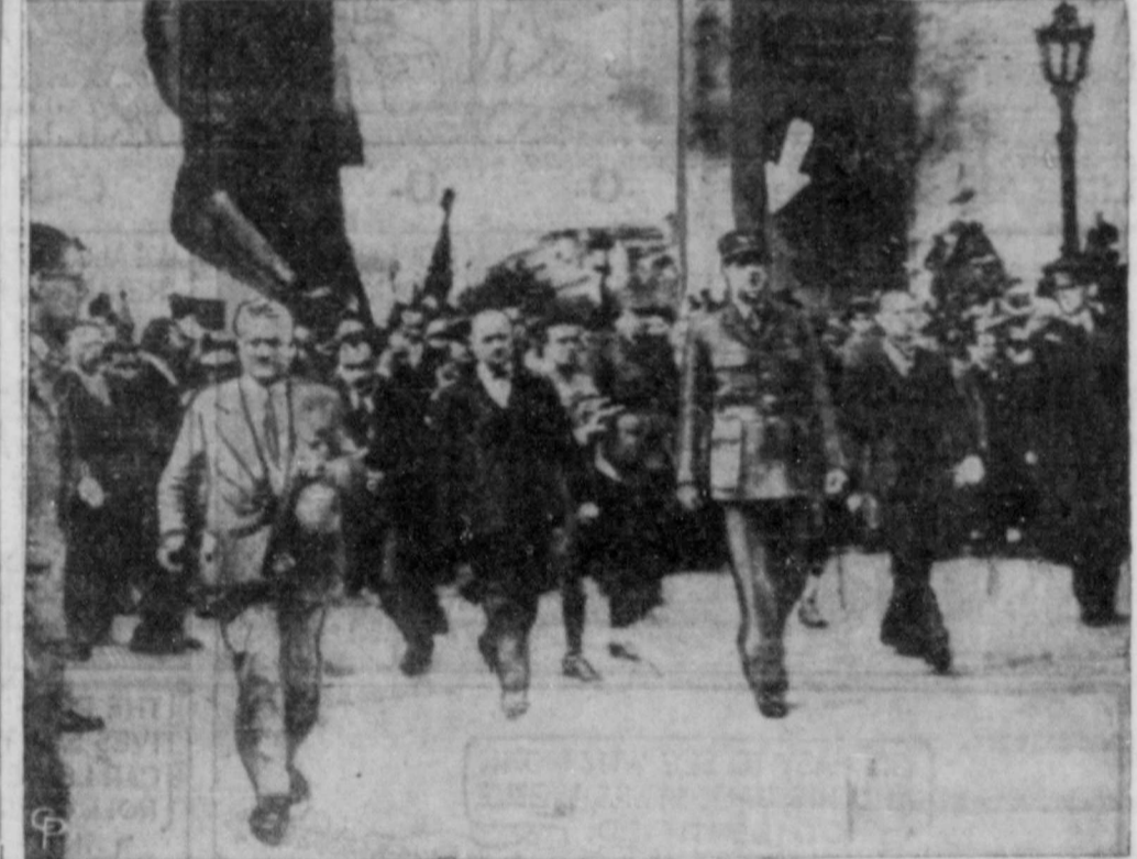
Gen. Charles De Gaulle, leader of the Free French Forces, makes a triumphant entry into Paris and is shown in this U. S. Signal Corps radiophoto passing under the Arc de Triomphe. De Gaulle later escaped injury twice, once when gunfire broke up the great liberation parade and a second time when French Fascists tried to kill him in Notre Dame Cathedral.