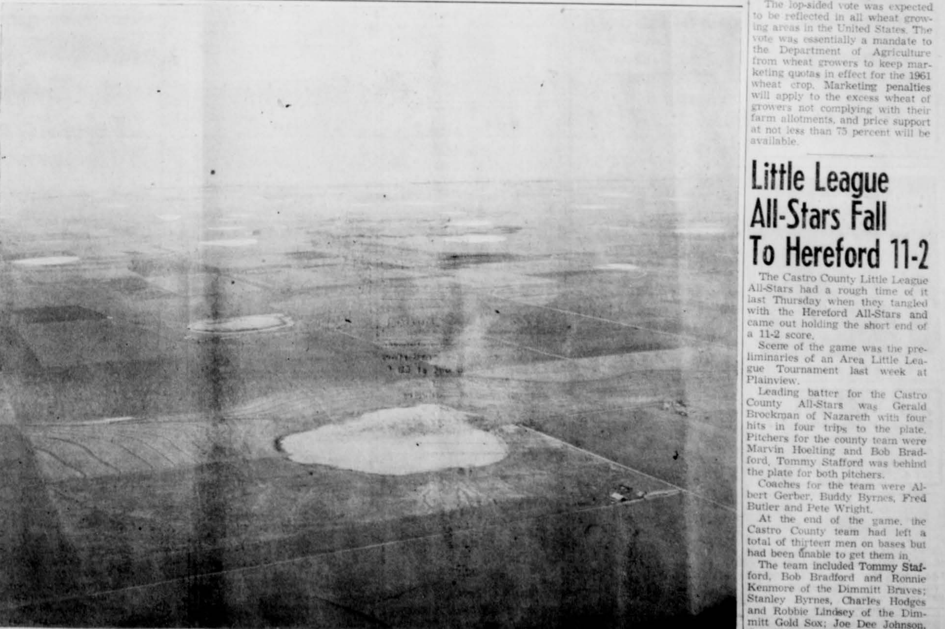
AFTER THE RAINS—Minnesota's "Thousand Lakes" region has nothing on Castro County following the rains of the past several weeks. Some 8 to 9 inches of rain deluged the area and sent hundreds of small playa lakes to their highest level in years. In this photo, taken from the west and looking east towards Dimmitt, can be seen many of the small lakes. This is a typical area of the county and from a high altitude the lakes compose a checkerboard pattern extending as far as the eye can see. These lakes are the result of a lack of natural drainage in this country and are unique to the Great Plains area.