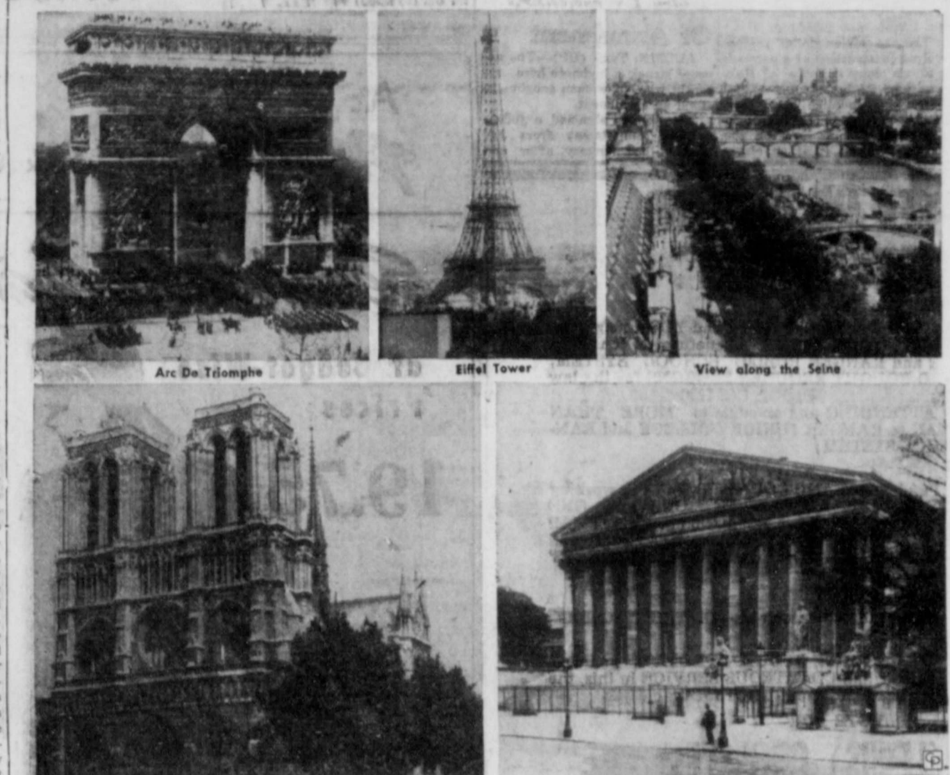
Pictured above are Paris scenes which will be viewed by American troops already moving into the liberated city, for the second time in a single generation.