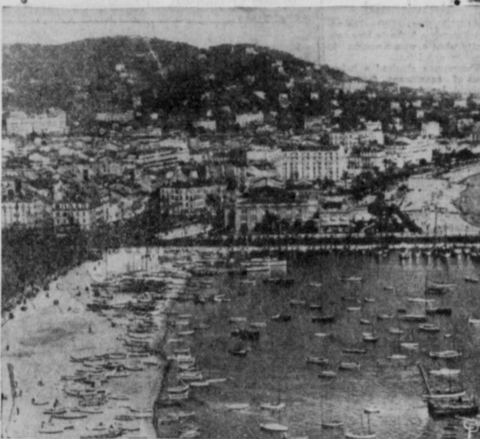
AN INTERNATIONAL PLAYGROUND in the south of France in the pre-war days, Cannes, above, today is reopened for "tourists," only these travelers are not there for a vacation.