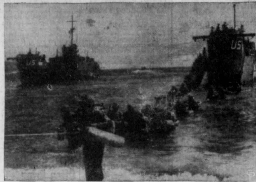
American infantrymen, debarking from an LCI, wade chest-deep through the surf onto a beach east of Toulon, France, on D-Day. Their landing at this point was unopposed by the enemy. This is a United States Army Signal Corps photograph, radioed from Italy. (International Soundphoto).