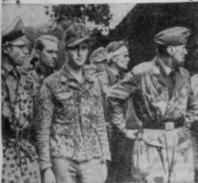
THESE ONCE TOUGH SS OFFICERS captured by the Second armored division during the Allied advance in France are lined up after being taken prisoners. The Nazis are the best troops Hitler had, but their regiment, the famous "Goek von Berlichingen," was annihilated after offering stiff resistance.