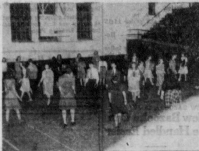
Pictured above is an interior view of the Ranger Junior College Recreation Building in which a group of the college students have gathered for an informal social hour.