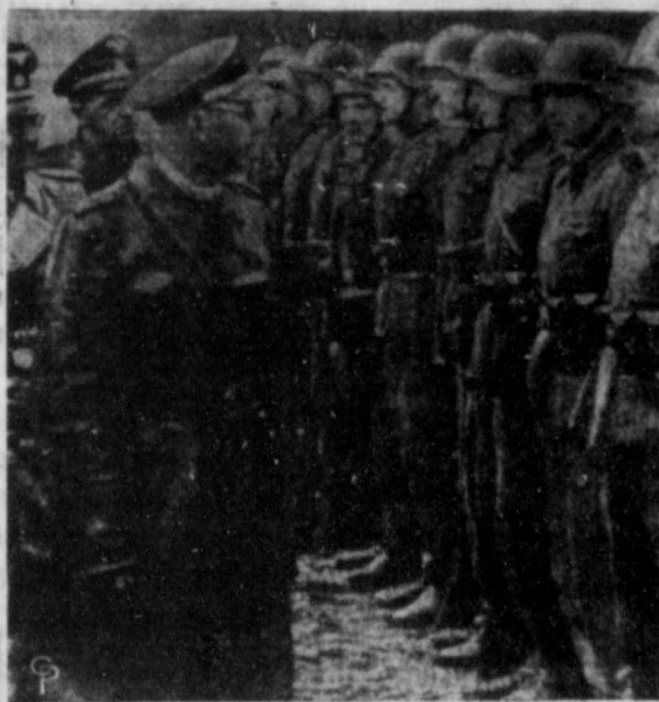
NAZI GESTAPO CHIEF Heinrich Himmler is shown in this photo which has just been received from abroad, as he inspected an S.S. infantry division somewhere in Germany. Himmler was appointed commander of all forces within the Reich a short time ago.