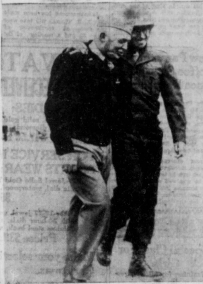
WITH HIS ARM TOSSED casually about the shoulder of Gen. Henry H. Arnold (left), Lt. Gen. Omar Bradley, ground forces chief in France, listens to the U.S. Air Force commander during a stroll through a battle area in Normandy, while on an inspection tour.