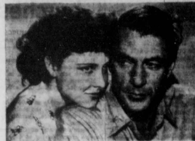
Laraine Day and Gary Cooper, starred in "The Story of Dr. Wassell," the new Paramount Technicolor epic of a country doctor at the front.