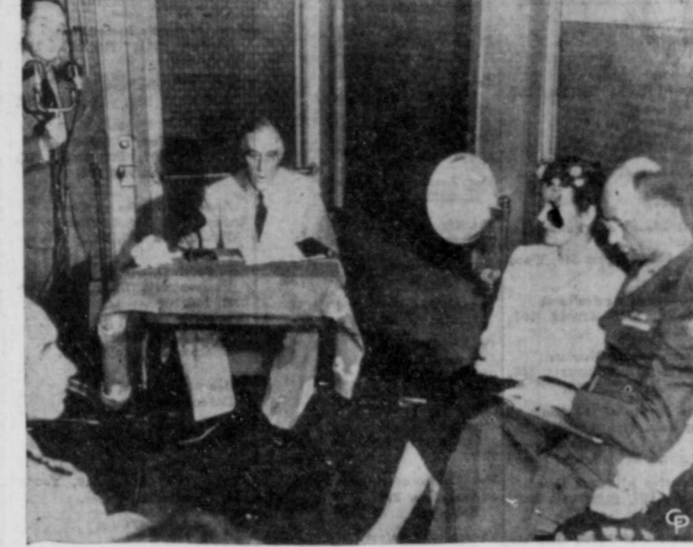
Sitting in a train at a west coast naval base, President Roosevelt broadcasts his acceptance speech to Presidential nominees of the Democratic Party to the assembled delegates in the Chicago Stadium. On the right are Col. and Mrs. James Roosevelt.