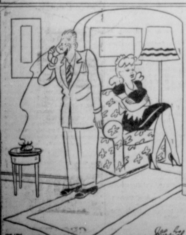
"Not tonight, Sam. The wife's out and I gotta stick around and make sure the new maid doesn't run out on me."