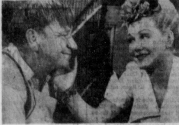
Wallace Berry and Gloria Dickson in a scene from MGM's comedy hit, "Kavanaugh," with Marjorie Main, Donald Meek and Dorothy Morris.