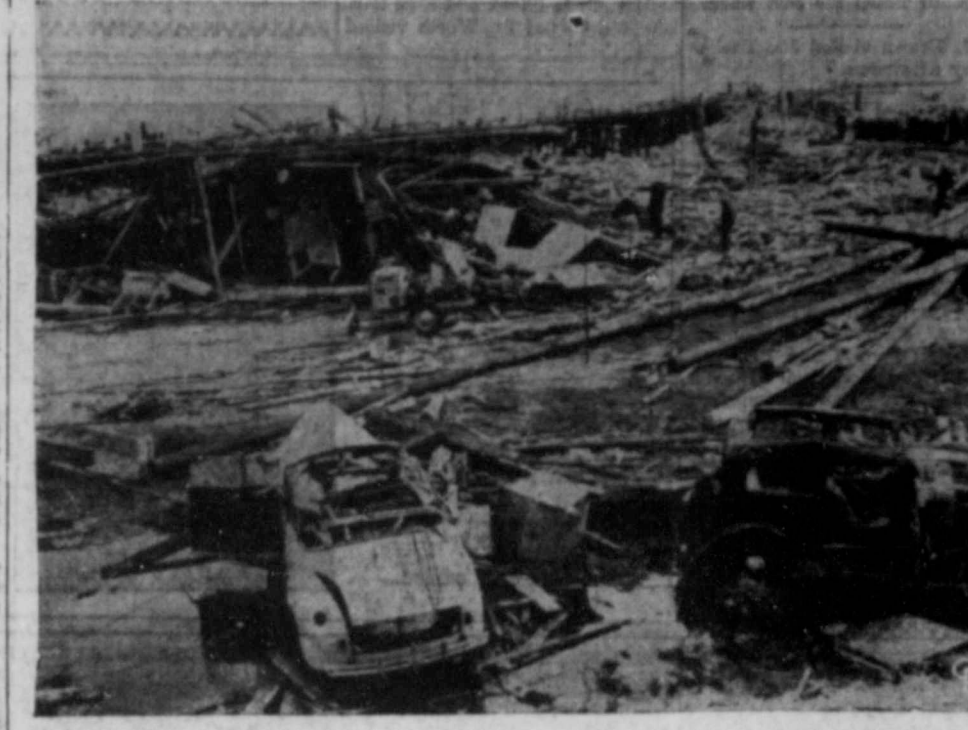
Some idea of the damage done by the terrific explosion of two ammunition ships may be had from this picture of the havoc wrought at Port Chicago, Calif. Navy Depot. The catastrophic explosion took the lives of several hundred persons and sent many more to hospitals. The picture is of the wrecked pier.