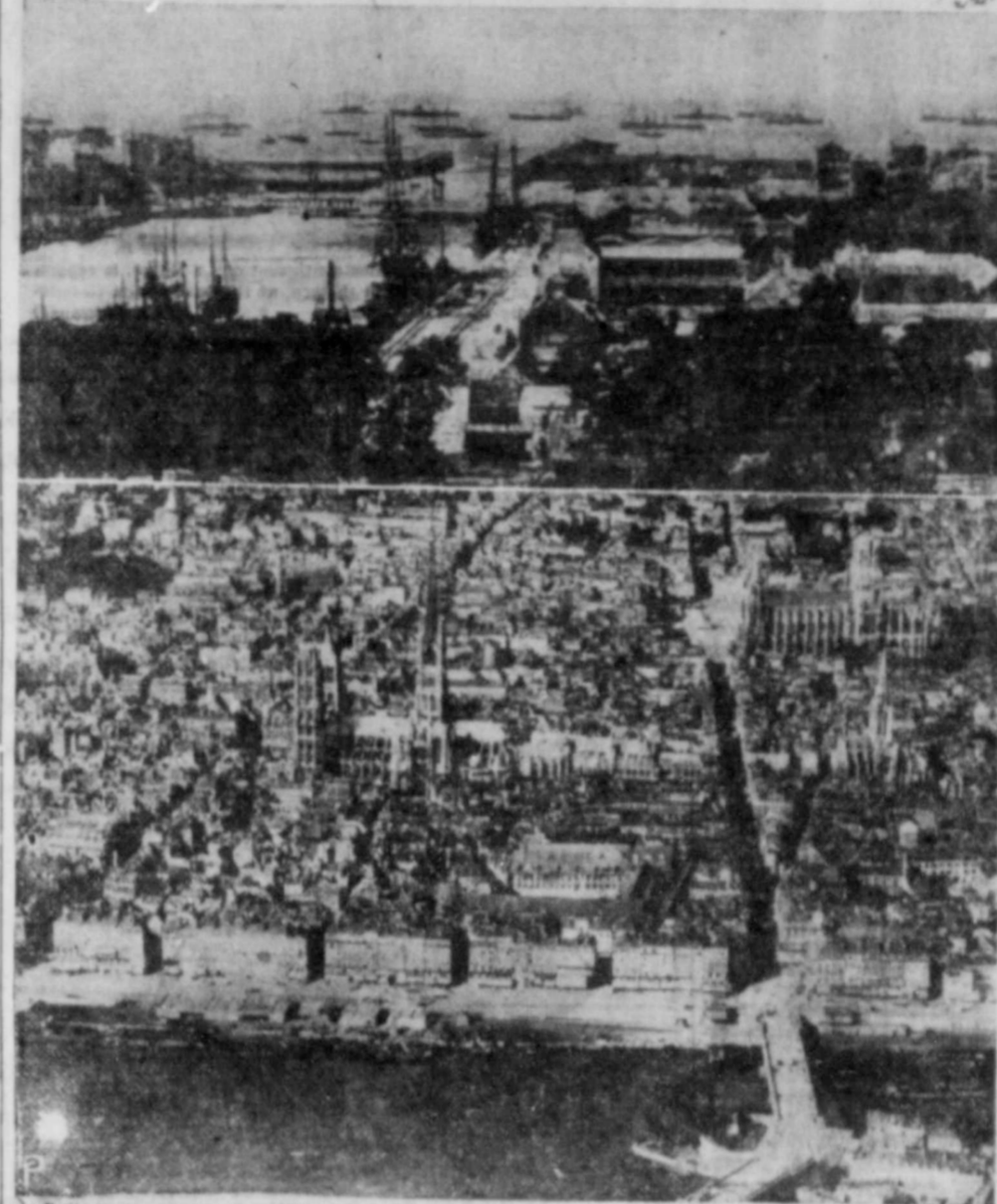
WITH ALLIED LANDINGS on the French coast effectively executed, the troops turn their attention now to the planned goals. Two of the French cities awaiting liberation from the Hitler regime are Cherbourg, view of which is shown at the top above, and Rouen, at the bottom. Cherbourg is located at the southern tip of the Allied beachhead established in the invasion, while Rouen lies approximately 50 miles inland from Le Havre, another important French seaport.