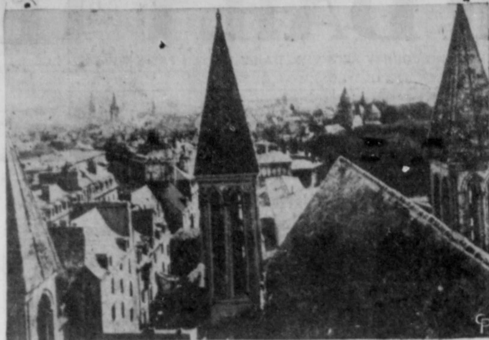
CAEN, capital of the Department of Calvados, France, and 30 miles southwest of La Havre, is reported to be the center of heavy fighting. Caen is 10 miles inland from the sea, at the base of the 75-mile-wide Normandy peninsula. It is built in the middle of a fertile plain.