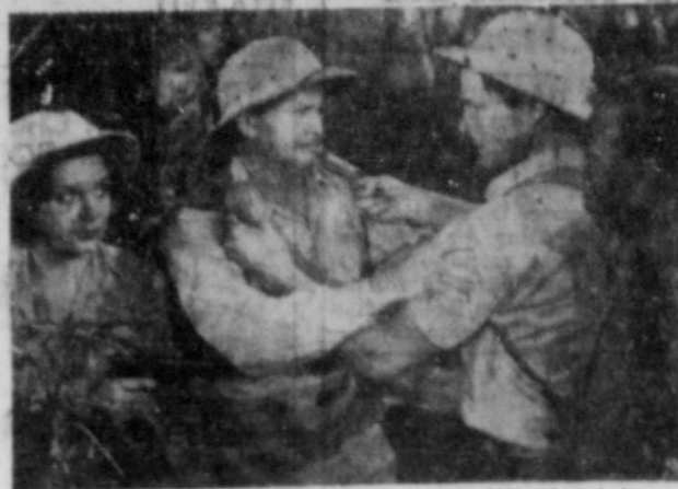
There's action and thrills galore in "Nabonga," weird tale of jungle love, with Buster Crabbe, Barton MacLane, Fifi D'Orsay and Julia London.