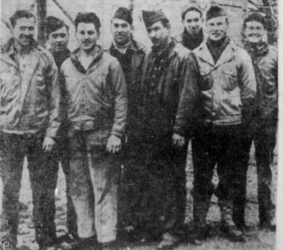
This unidentified group of American prisoners of war are confined at the base camp of Stalag III B, which is situated somewhere in Germany. They are members of a prison camp work detachment. This photograph was taken by an International Red Cross picture.