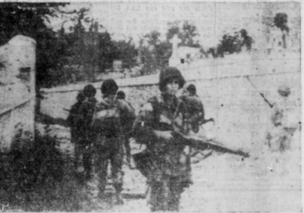
A grim-faced American paratrooper, in the top photo, with binoculars around his neck and cigar dangling from his lips, receives direction from two French civilians "somewhere in France." In the lower picture, United States paratroopers are shown moving cautiously through a French churchyard, taking advantage of the cover provided by a stone wall.