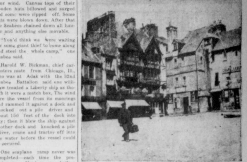
Allied armored forces thrusting steadily deeper into Normandy were reported approaching the ancient and quaint Norman town of St. Lo. Pictured above is a typical 15th century timber and stone structure in St. Lo. Building was once a hospital.