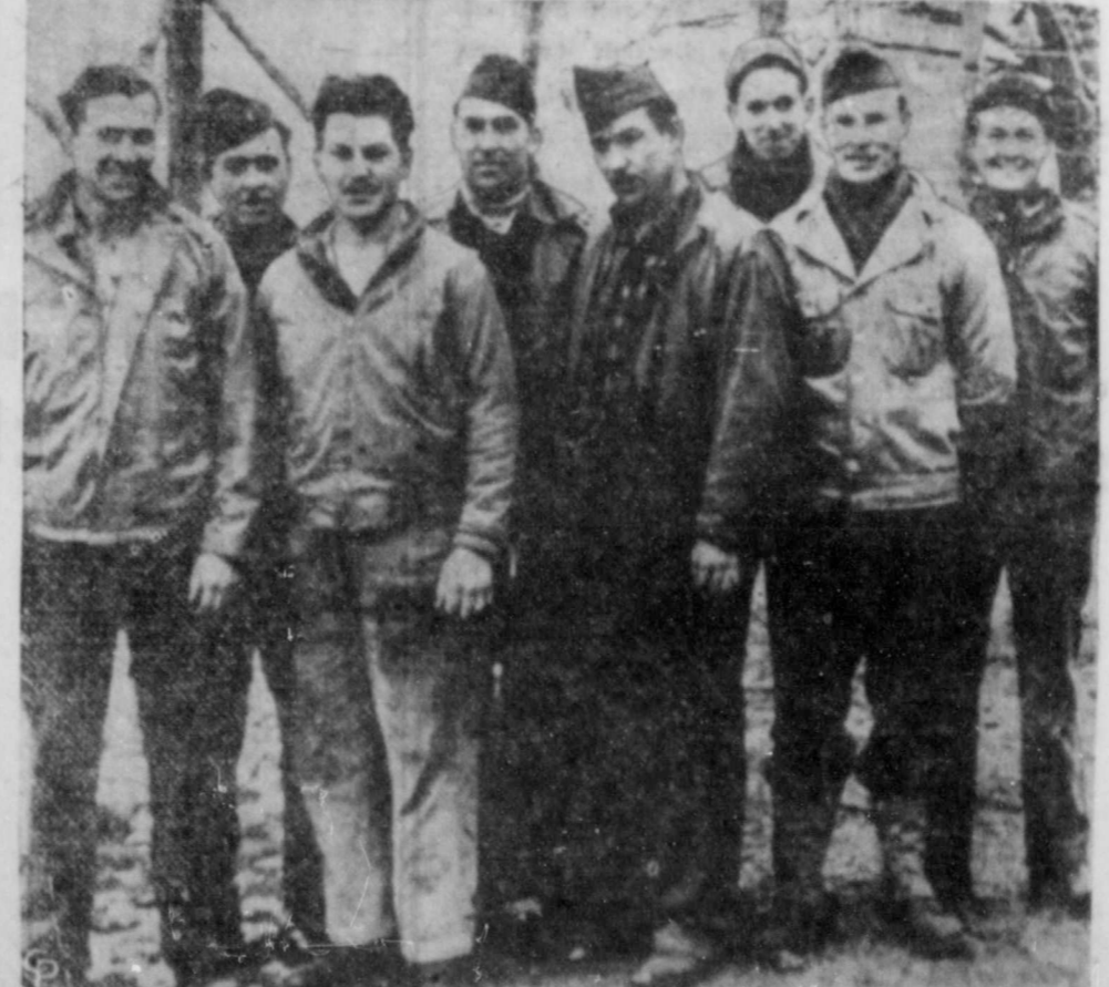
This unidentified group of American prisoners of war are confined at the base camp of Stalag III B, which is situated somewhere in Germany. They are members of a prison camp work detachment. This photograph was taken by an International Red Cross picture. (International Soundphoto)