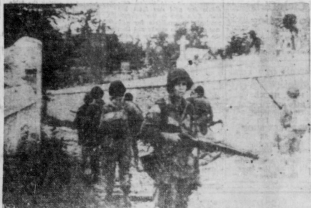
A grim-faced American paratrooper, in the top photo, with binoculars around his neck and cigar dangling from his lips, receives direction from two French civilians "somewhere in France." In the lower picture, United States paratroopers are shown moving cautiously through a French churchyard, taking advantage of the cover provided by a stone wall.