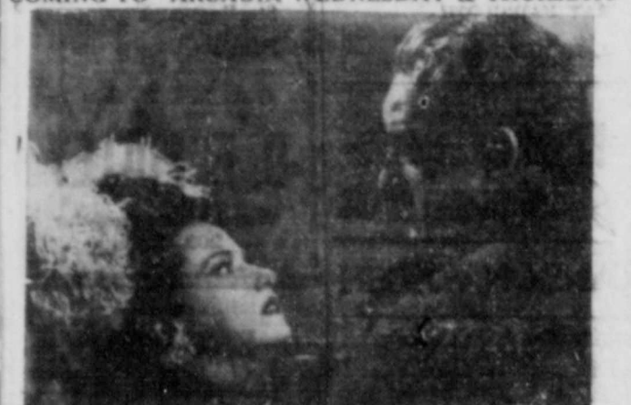
Merle Oberon and Ludo Cregar in a tense scene from 20th Century-Fox's 'The Lodger,' a gripping story of the notorious Jack the Ripper.