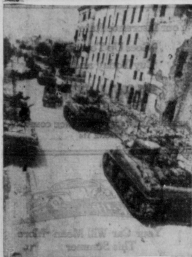
AMERICAN MEDIUM TANKS and mechanized equipment are shown pushing on to Gaeta and Itri, Italy, through Formia's main street. Photo was made by the U. S. Signal Corps during the current Allied drive toward Rome. (International Soundphoto)