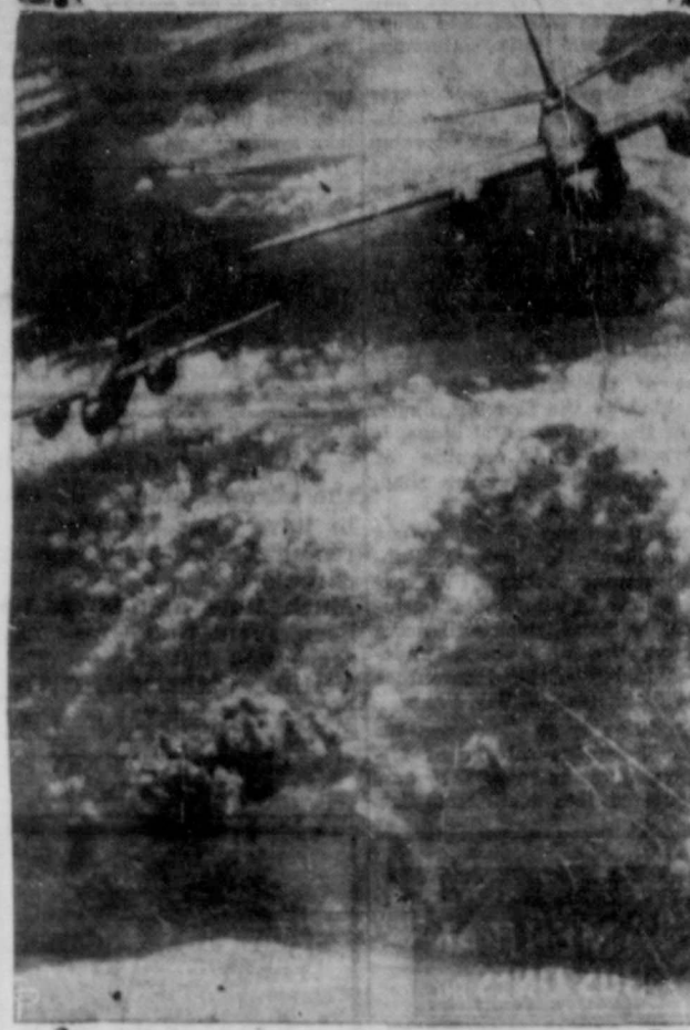
CONTINUING THE INCESSANT bombing of Nazi Europe, U. S. B-24 Liberator bombers cross the French coastline to strike at another Nazi installation in France.

that has received national publicity for their mass rope artistry. During her last year she was major or leader of the group.