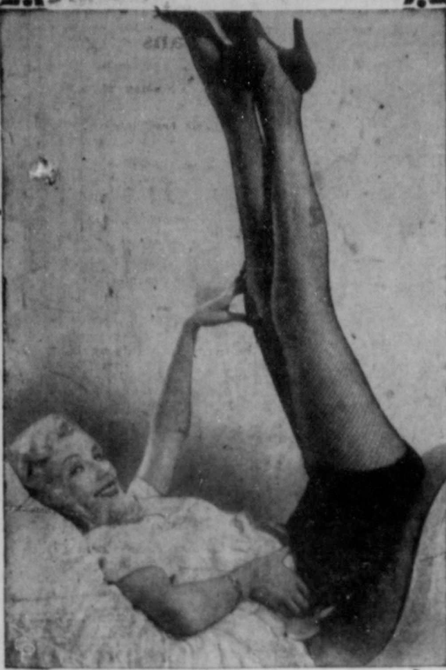
HER HEELS IN THE AIR, Dolores Moran, lovely screen player who will star in the picture, "The Horn Blows at Midnight," gives her impression of the "1944 Pin Up Girl."

Two of the pilot barges now anchored off Spring City in Ilika county can process, freeze and pack local fish catches, and crops along the 1,200 mile waterways system of the TVA.