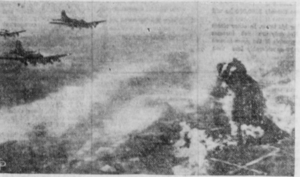
AMERICAN BOMBING PLANES deal a blow to the German bomber base at Avord, near Bourges, France. This was the base for Nazi anti-shipping patrols in the Bay of Biscay. (Internationals)