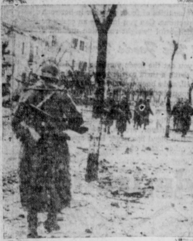
THESE GERMAN TROOPS are marching through a town still held by their forces on the Anzio, Italy, front. The houses have been heavily damaged by Allied artillery fire. The picture has just been received in the United States from a neutral source.