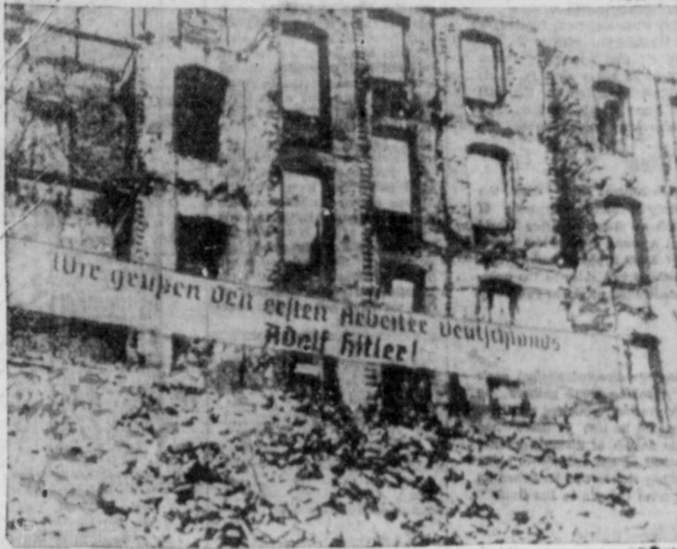
THIS STREAMER put up by Propagandist Josef Goebbels in observance of Adolf Hitler's 55th birthday reads, translated, "We Greet the First Worker of Germany—Adolf Hitler." Ironically, the streamer decorates the shell of a bombed out Berlin building, symbol of Allied air supremacy.