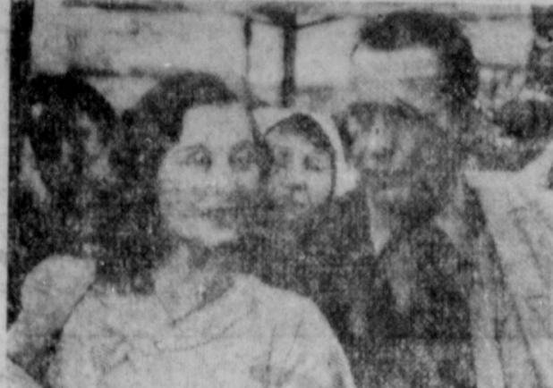
Michele Morgan and Humphrey Bogart in a scene from their late and timely motion picture, "Passage to Marseille," with Claude Rains.

Number of births in this county between April 1, 1940, and Nov. 1, 1943, was approximately 9,604,000. In the same period, the civilian population decreased from 131,329,104 to 127,507,884 through inductions into the armed services.