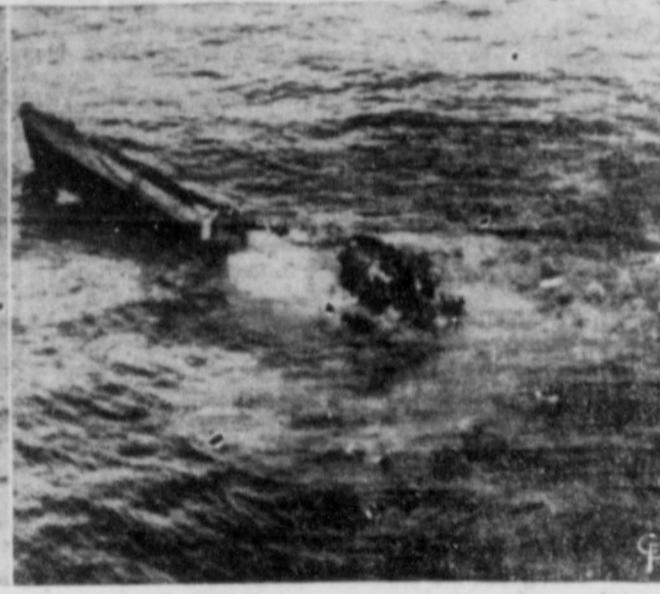
down the Nazi crew abandons ship, right. The plane was hit by the submarine's deck gun but the crew members chewed up 50 odd sticks of chewing gum and plugged up the hole.