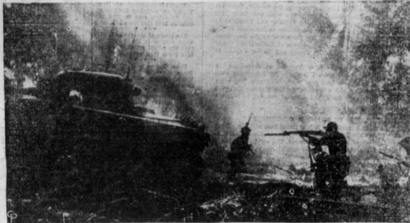
SOMEWHERE AHEAD there are Japs. The dirty Japs that raped Nanking. American soldiers, members of the 27th division, former Ohio National Guard, are after them. The scene is Bougainville, Solomon Islands. This is the real thing. A tank goes forward with infantrymen following. One soldier gets out of a foxhole at right. Another crawls forward in center. The man in foreground is firing. The soldier nearest the tank is running to another position. The Japs were attacking U. S. positions in the Ferguson Augusta Bay beachhead. In 18 days of this type of bitter fighting more than 7,000 Japs were killed.