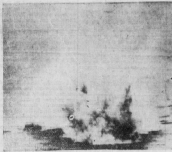
THESE SPECTACULAR PICTURES show how the Allies are winning the Battle of the Atlantic. An RCAF Sunderland flying boat scored against a German submarine, left, and, as the U-boat goes