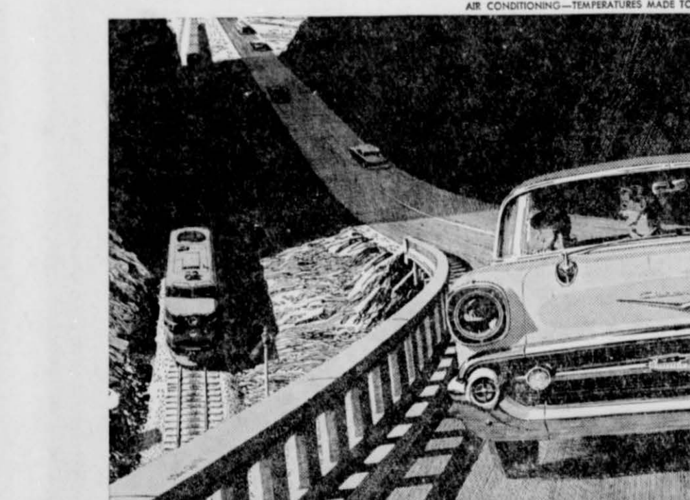
The Sweet, Smooth and Sassy '57 Chevrolet...