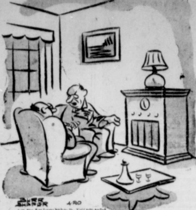
"Every time I hear this company's program I wish I used their product—so I could stop!"

day. The average cow eats 100 lbs. of grass per day provided that the grass is available.