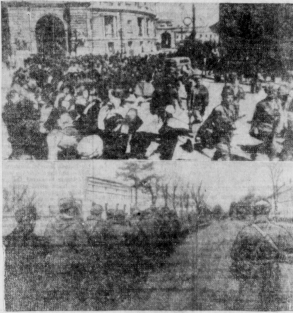
THESE RADIOPHOTOS FROM MOSCOW show Red Army troops entering Black sea city of Odessa, re-taken April 10 after furious fighting, and also German prisoners captured.