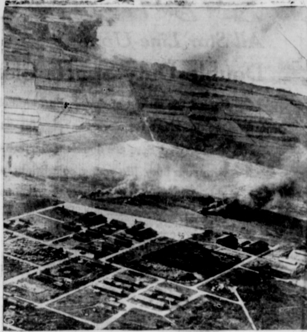
CAUGHT ON THE GROUND by carrier-based planes of the U. S. Navy, Jap planes burn fiercely on their home fields on Rabaul island in the Marianas.