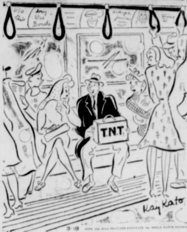
"I always get a seat, Ma'am, even though these are only my personal initials!"