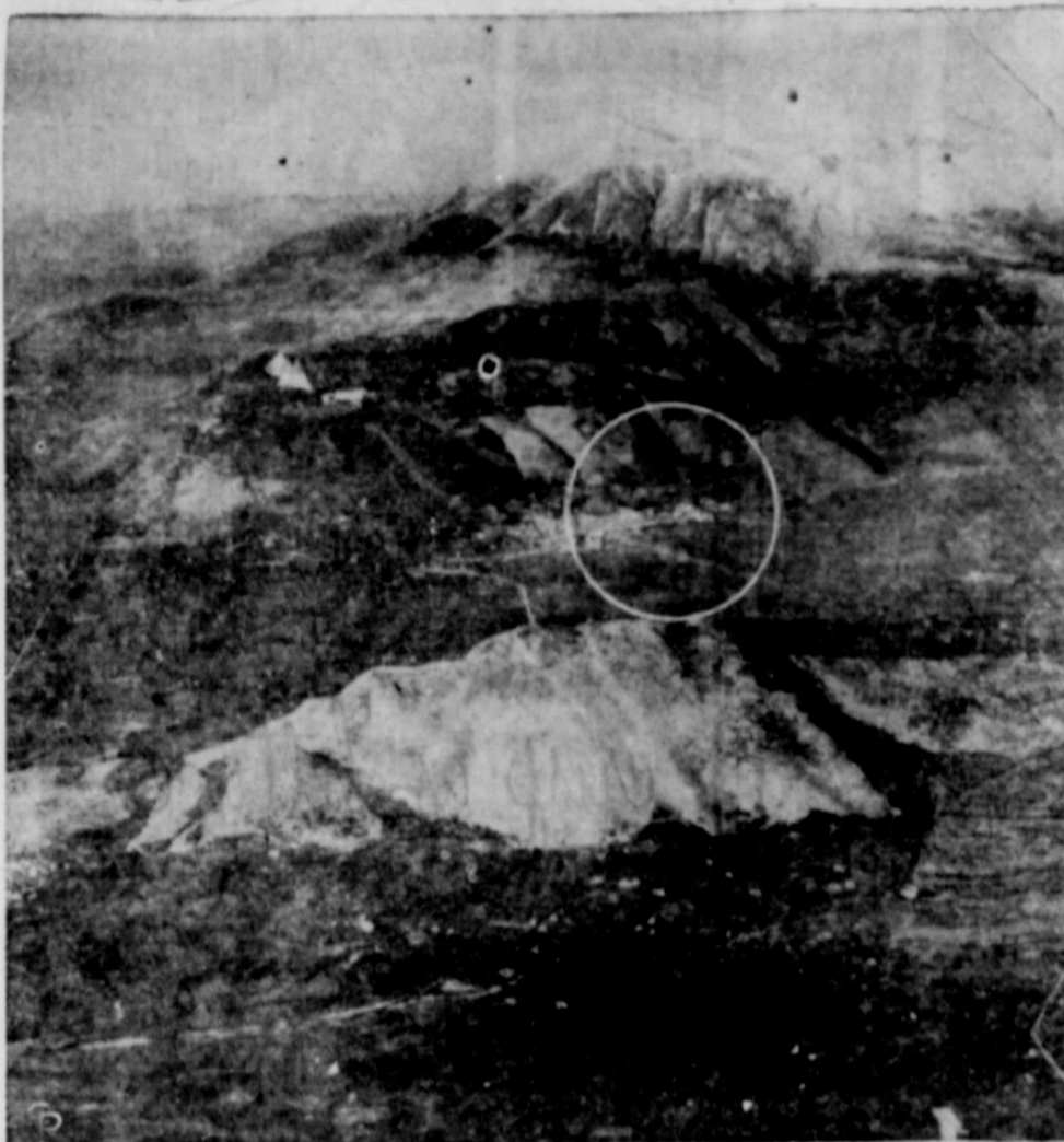
THIS PHOTO OF THE ITALIAN BATTLEGROUND will give you some idea of the rough terrain, the mountains and valleys the Allies must traverse in their advance northward toward Rome. The city of Cassino, where bitter street fighting continues, is circled. In foreground is Mt. Trocchio, and in extreme background is Mt. Cairo. Between the two mountains is the Liri valley. Route to Rome is to the left in the picture. Nazis reportedly are holding on to Cassino despite fierce U. S. attacks. The town itself is a rubble-heap with German troops fighting from cellars, roofs and surrounding peaks. The town is being shelled almost ceaselessly by the Allies. The famed Monte Cassino monastery, cradle of the Benedictine Order, was struck by stray German shells. Monastery is indicated by arrow.