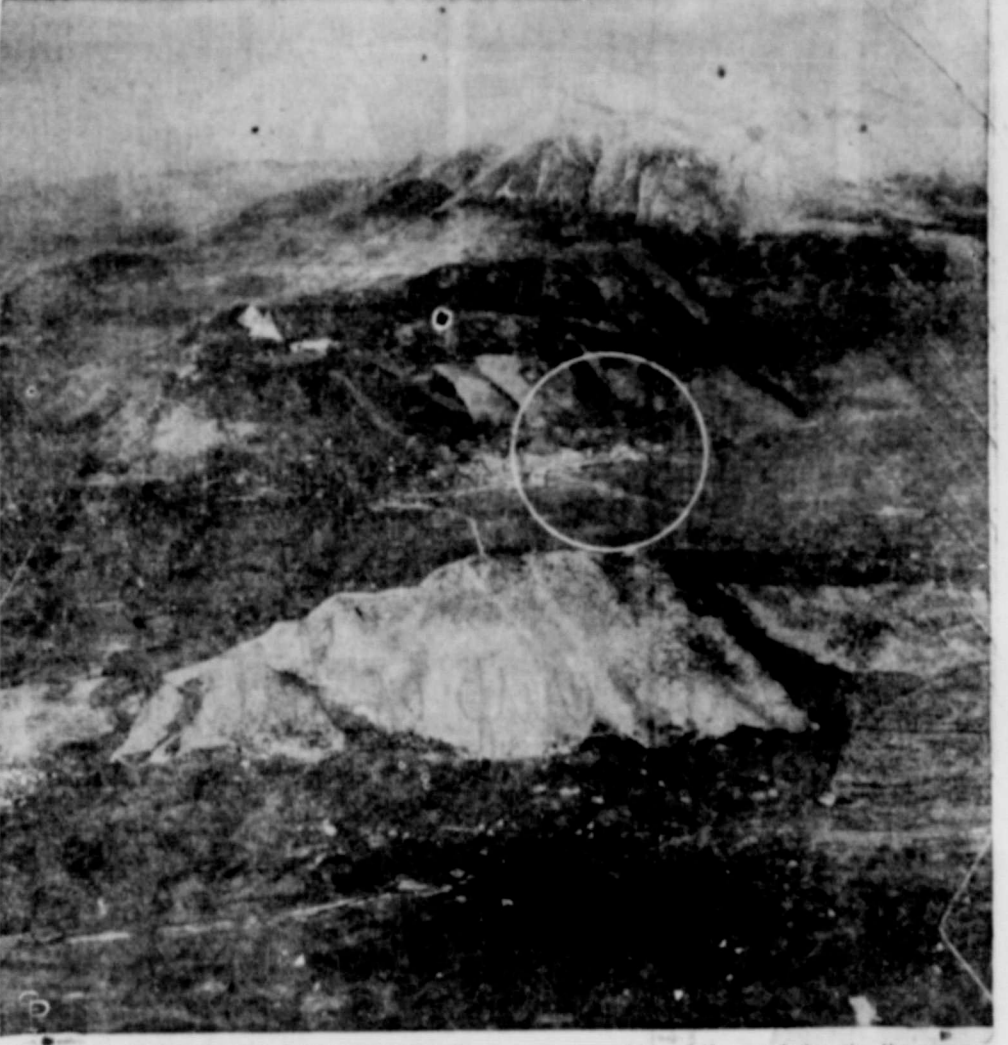
THIS PHOTO OF THE ITALIAN BATTLEGROUND will give you some idea of the rough terrain, the mountains and valleys the Allies must traverse in their advance northward toward Rome. The city of Cassino, where bitter street fighting continues, is circled. In foreground is Mt. Trocchio, and in extreme background is Mt. Cairo. Between the two mountains is the Liri valley, Route to Rome is to the left in the picture. Nazis reportedly are holding on to Cassino despite fierce U. S. attacks. The town itself is a rubble-heap with German troops fighting from cellars, roofs and surrounding peaks. The town is being shelled almost ceaselessly by the Allies. The famed Monte Cassino monastery, cradle of the Benedictine Order, was struck by stray German shells. Monastery is indicated by arrow.