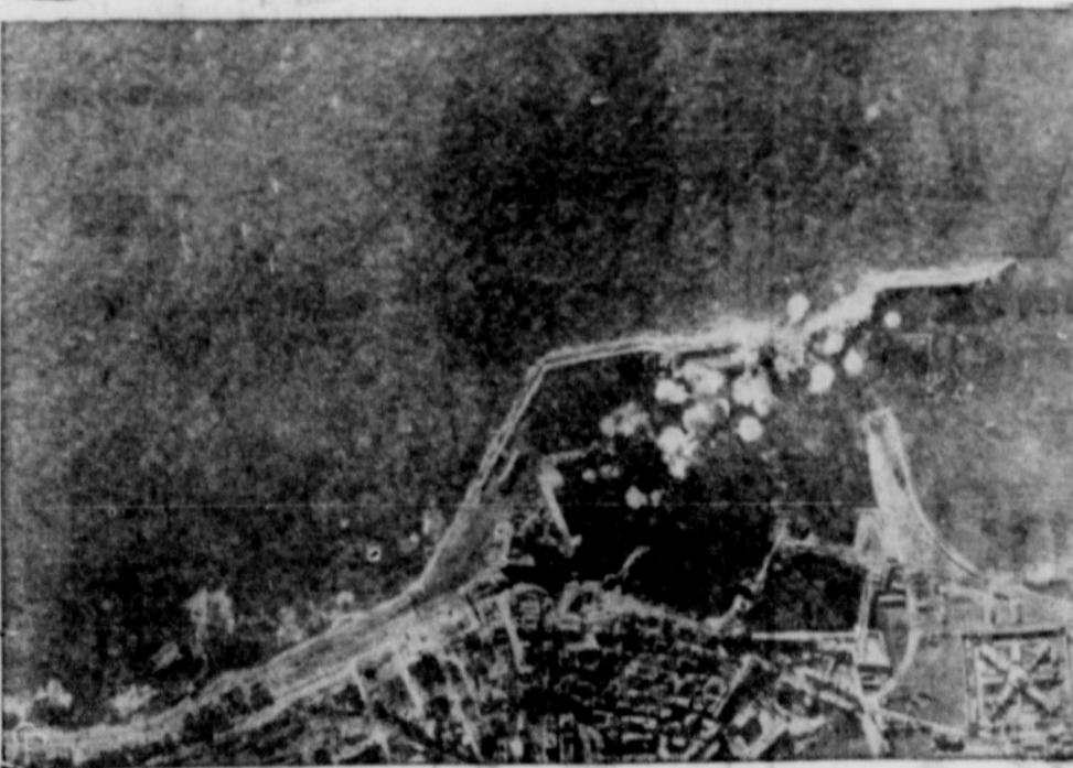
AFTER DROPPING THEIR LETHAL LOADS on the Nazi-held Italian port of Civitavecchia, 35 miles northwest of Rome, a dozen B-25 Mitchell medium bombers of the U. S. Army's 12th Air Force swoom away to the left in this spectacular picture. Puffs from the bomb bursts and smoke from burning structures are visible along the entire length of the mole.