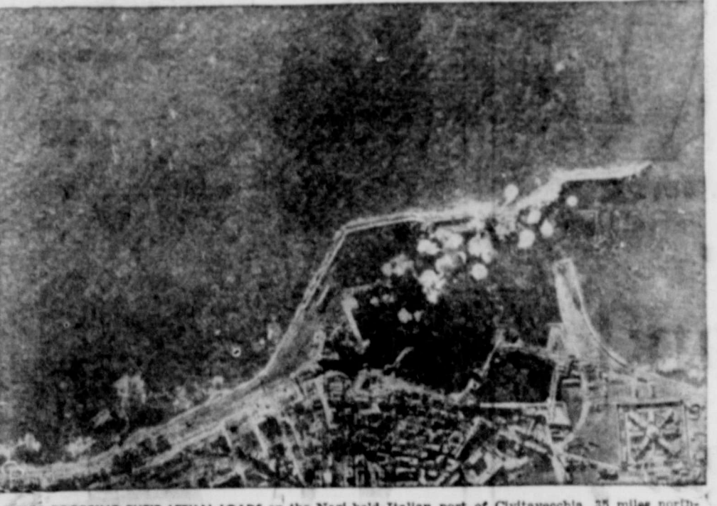
AFTER DROPPING THEIR LETHAL LOADS on the Nazi-held Italian port of Civitavecchia, 35 miles northwest of Rome, a dozen B-25 Mitchell medium bombers of the U. S. Army's 12th Air Force swoon away to the left in this spectacular picture. Puffs from the bomb bursts and smoke from burning structures are visible along the entire length of the mole.