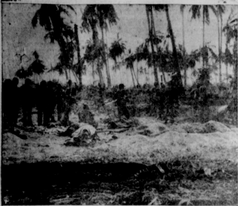
THERE'S A LULL IN THE FIGHTING on Bougainville Island in the South Pacific, and a burial party of Marines digs fresh graves in the sand for the bodies of their comrades killed in battle with the Japanese.