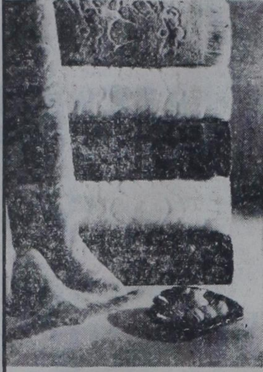
SEA SHELL JACQUARDS