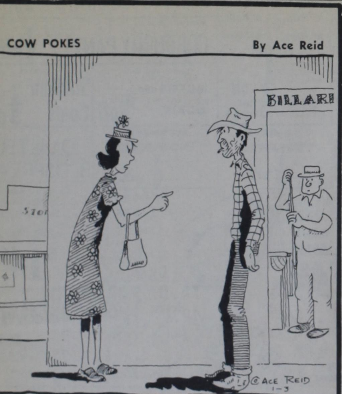
"Yes, Jake I'd divorce you if you wasn't at the awkward age, yer to old to git married agin and too young to stay single!"