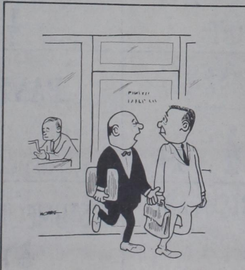
"The boss is okay now, but ten years ago he used to get in my hair."

We have had some unusual weather Saturday and Sunday. We only got a trace of moisture. Everyone could sure use a good rain or wet snow.