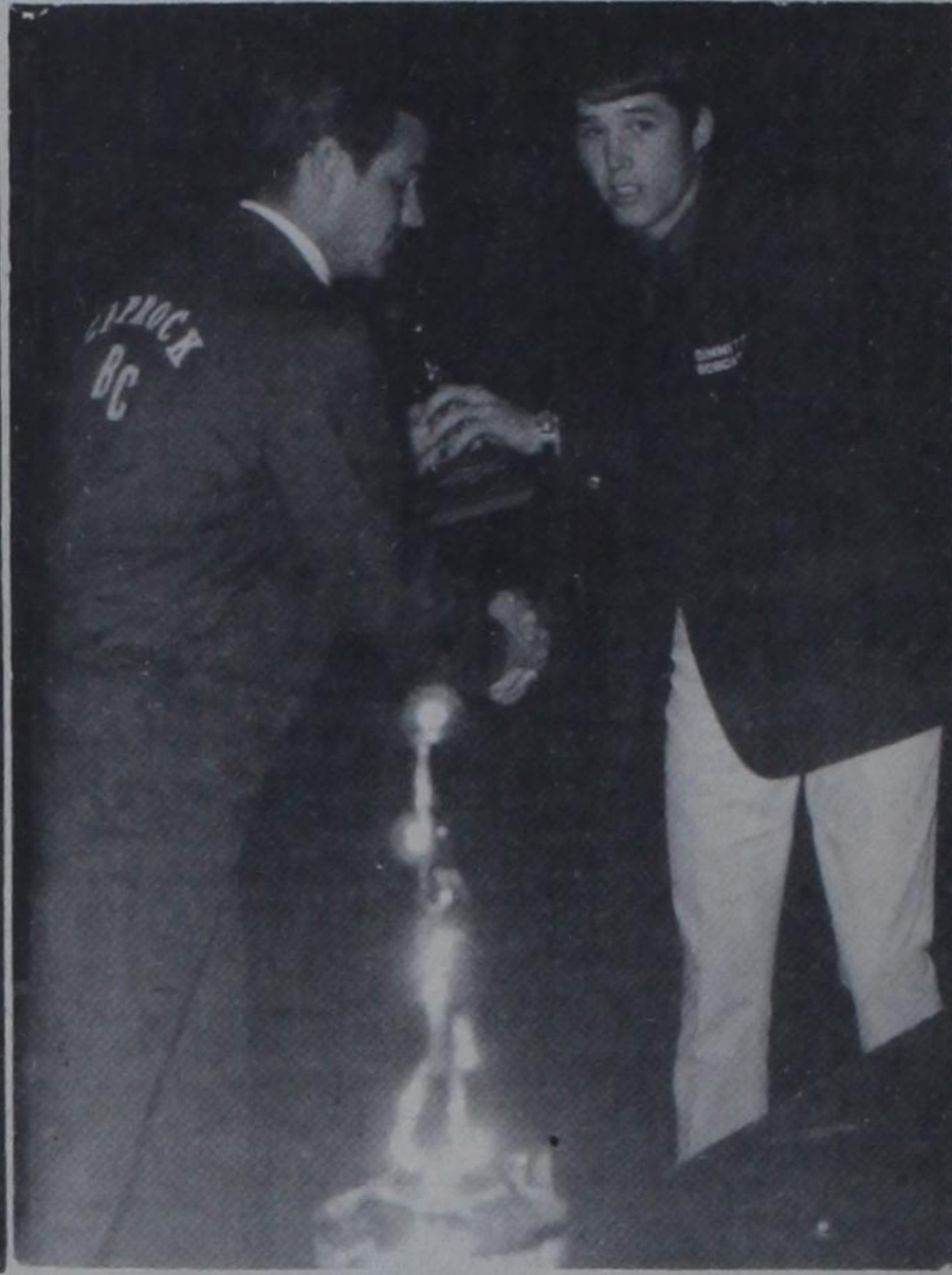
ALL-TOURNAMENT honors went to two Dimmitt seniors last week at the Farwell Tournament for girls and the Caprock Holiday Tournament in Lubbock for boys.