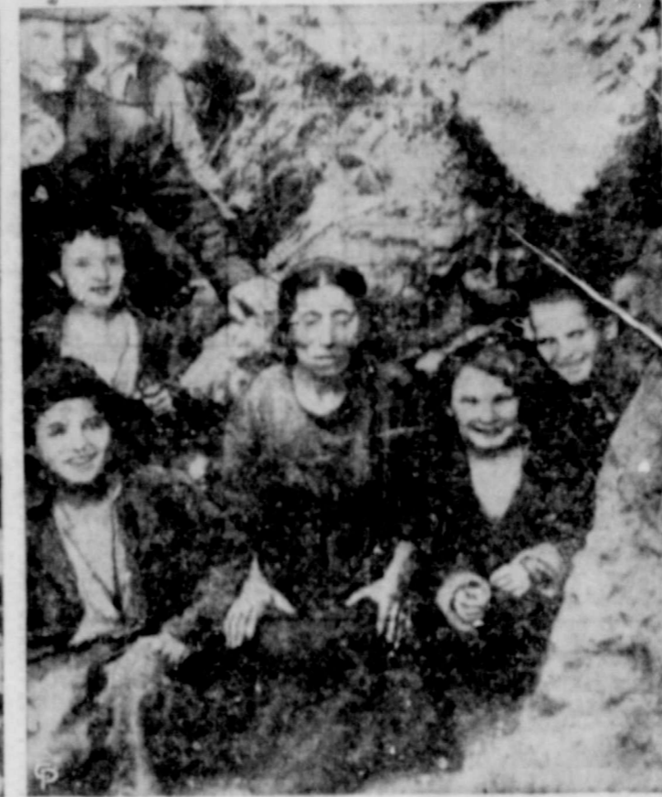
radiophoto above, the natives joyfully asked for and received food and clothing from the Yanks. In one of the churches in the city, blasted to rubble during the battle, the statue of the Madonna of the Waters escaped damage. It miraculously had escaped unscathed once before during a devastating earthquake in the city in 1815.