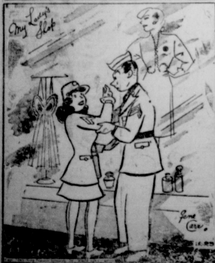
"What's your hurry? You stared long enough at that window of golf clubs and checkered linen!"