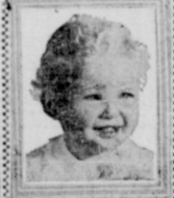
Precious Moments to Preserve