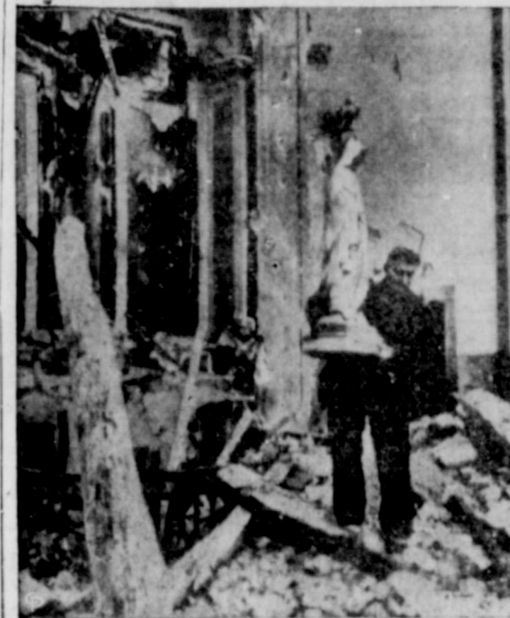
BATTLE FOR SAN PIETRO, ITALY, one of the hardest-fought engagements in the current Italian campaign, ended with the Yanks in occupation of what was once a thriving mountain city. For a week, native women huddled their families in caves as the Americans bombarded the Nazi positions in a furious battle to dislodge the enemy. Then, emerging as shown in the U. S. Signal Corps