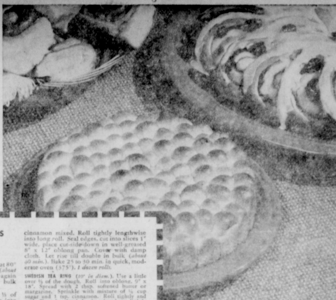
THIS 4-LAYER JELLY CAKE hails from frontier days! From an old Mormon cook book. A typical Betty Crocker "Kitchen-tested" recipe, for use with Gold Medal "Kitchen-tested" Flour. No comparable recipes match the Betty Crocker recipes in popularity! Try this one!