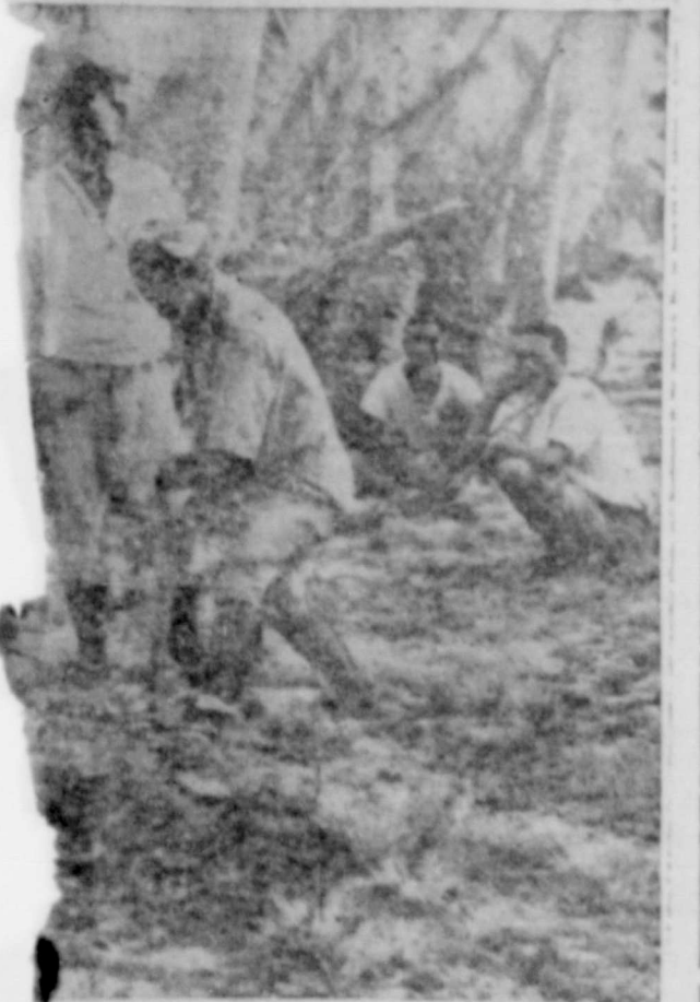
OR THE PROTECTION of their captors are dug on Tarawa by Japanese prisoners-of-war captured during the fierce battle of the Gilberts. No guards are shown in the picture, but Americans undoubtedly are watching.

SPREAD RUMORS Nazi agent. At a shop, in your home, DON'T let the TRUTH active. Best, Haircut In