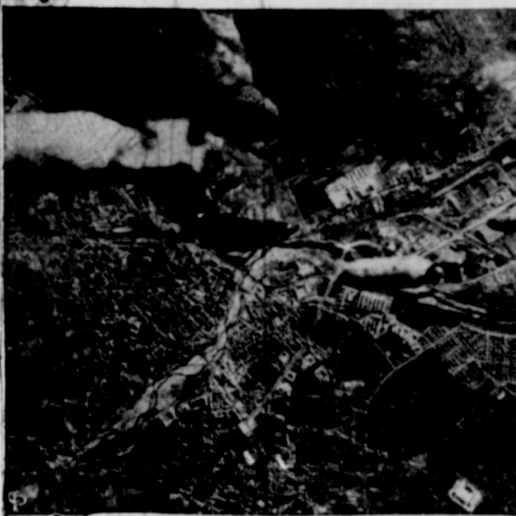
ACCURACY OF THE U. S. FLYING FORTRESSES in their daylight raids on objectives in Nazi Europe is shown clearly by these photos of an attack on the railroad yards at Bolzano, Italy, on Nov. 10. The city, 40 miles south of the Brenner Pass, is the northernmost important railroad junction through which the Nazis can move troops