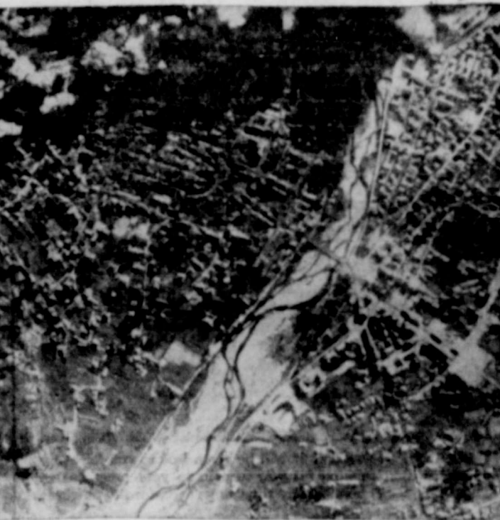
and supplies to the Italian front. It's "Bombs away!" in photo at left and they find their marks, right, leaving huge columns of smoke and fire over the railroad yards and shops. Day after day the Fortresses hammer their many targets. These are official United States Army Air Forces photos.