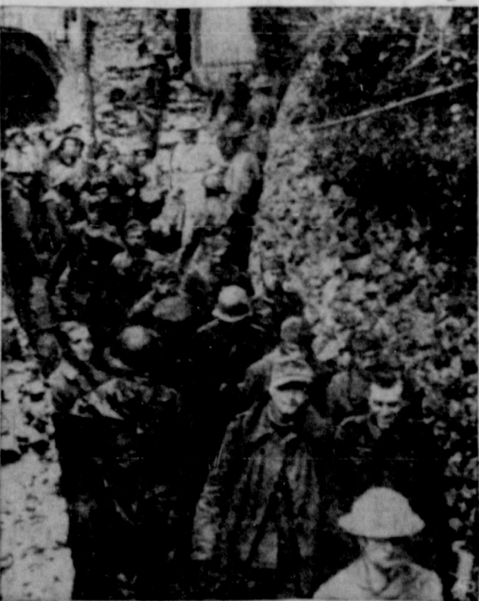
HEAVY FIGHTING has given the Allied armies in Italy most of the bitterly defended heights on the road to Rome. These Nazi soldiers were captured on Mount Camino by British troops of the Fifth Army.