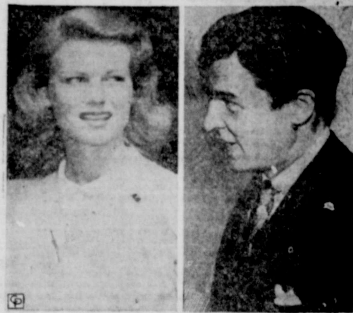
"IT'S NOT OFFICIAL, EXACTLY," says Actress K. T. Stevens, "but we're mutually agreed we're going to be married as soon as Al (Alfred G. Vanderbilt, Jr.) has a leave."