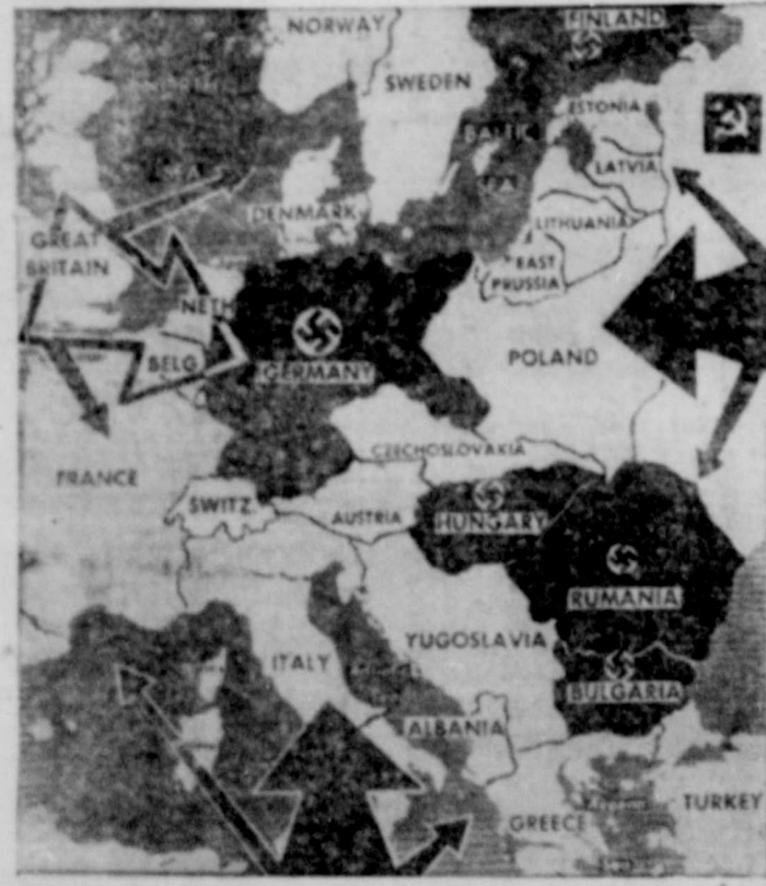
WHAT IS IN STORE for the various nations of Europe has been revealed—in part, at least—in the announcement of the Roosevelt-Churchill-Stalin conference in Teheran.