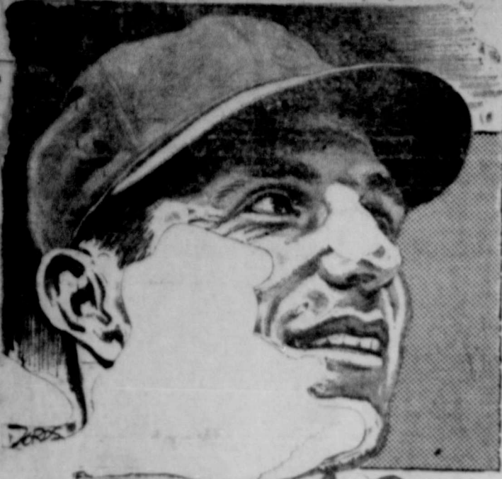
DOLF CAMILLI, FORMER DODGER AND GIANT STAR, SIGNED AS MANAGER OF THE OAKLAND COAST LEAGUE CLUB. DOLF WAS ONE OF THE MOST POPULAR PLAYERS EVER TO WEAR A BROOKLYN UNIFORM.