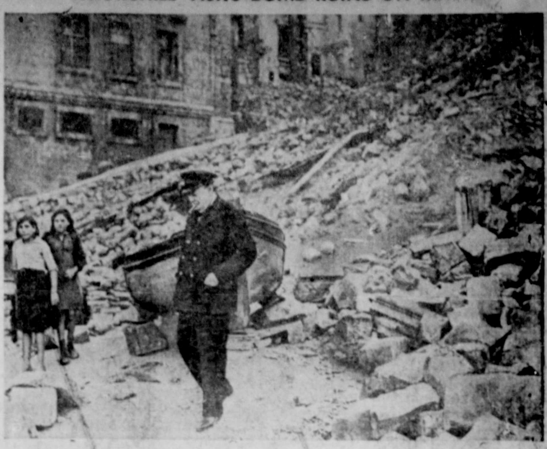
CHEWING ON HIS EVER-PRESENT CIGAR, Prime Minister Winston Churchill walks amid rubble left by Axis bombings on the Mediterranean island of Malta.