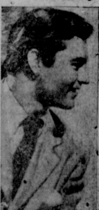
ELOPEMENT AND MARRIAGE of Singing Star Dinah Shore, photo, and George Montgomery, below, have been revealed in Hollywood.