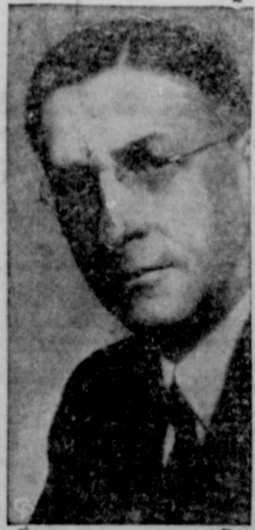
POSSIBLE BOLT by southerners from the Democratic party and the New Deal has been threatened by Senator Josiah Bailey, above, of North Carolina.