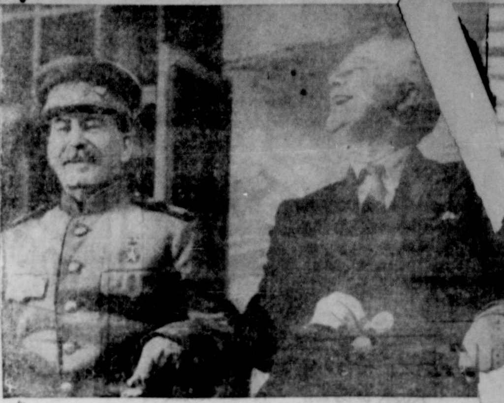
ALL IS SWEETNESS, LIGHT AND GOOD HUMOR as Premier Josef Stalin and President Roosevelt laugh together during their conference at Teheran, Iran.