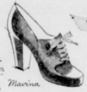
Marina This gallant little tie with square heel and toe does wonders for your feet, works wonders with your shoe annual!