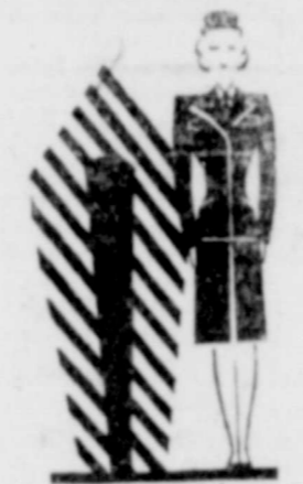
On 24 hour duty!

... here are fashions that will be constantly "in service—they do the work . . . and can take hours and hours of constant wear without showing it!