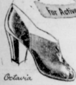
Octavia To market, to work, to play, this pert pump goes everywhere. For a trim fit, it's perfection itself.