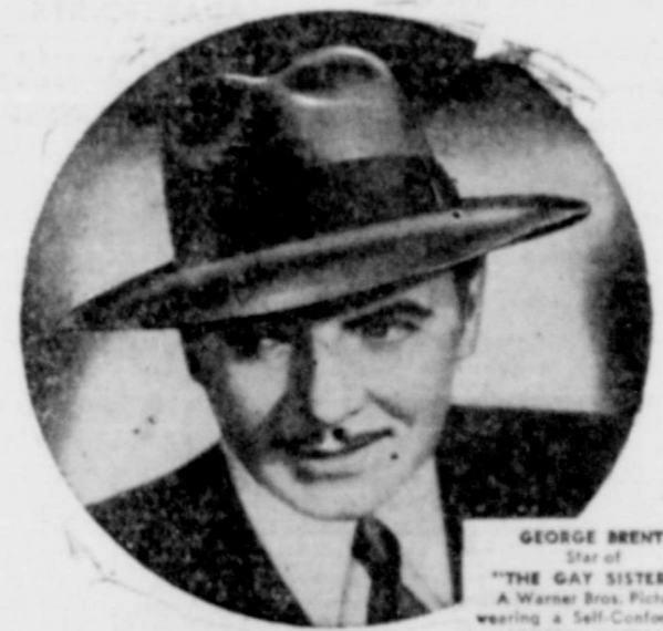
GEORGE BRENT Star of "THE GAY SISTERS" A Warner Bros. Picture wearing a Self-Conforming RESISTOL "AZTEC"

Men who want something really smart, go for this unusual attractive "AZTEC" model. Its rich appearance is enhanced by the specially wide bound edge. And the exclusive Resistol Self-Conforming feature provides comfort equal to its good looks.